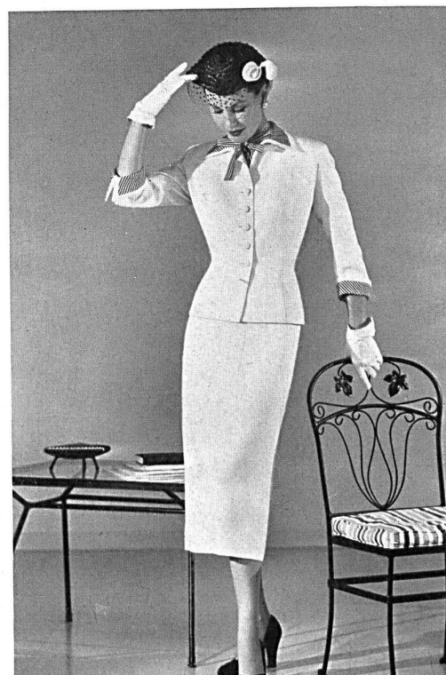
ATHENA White suit of Swiss synthetic fabric