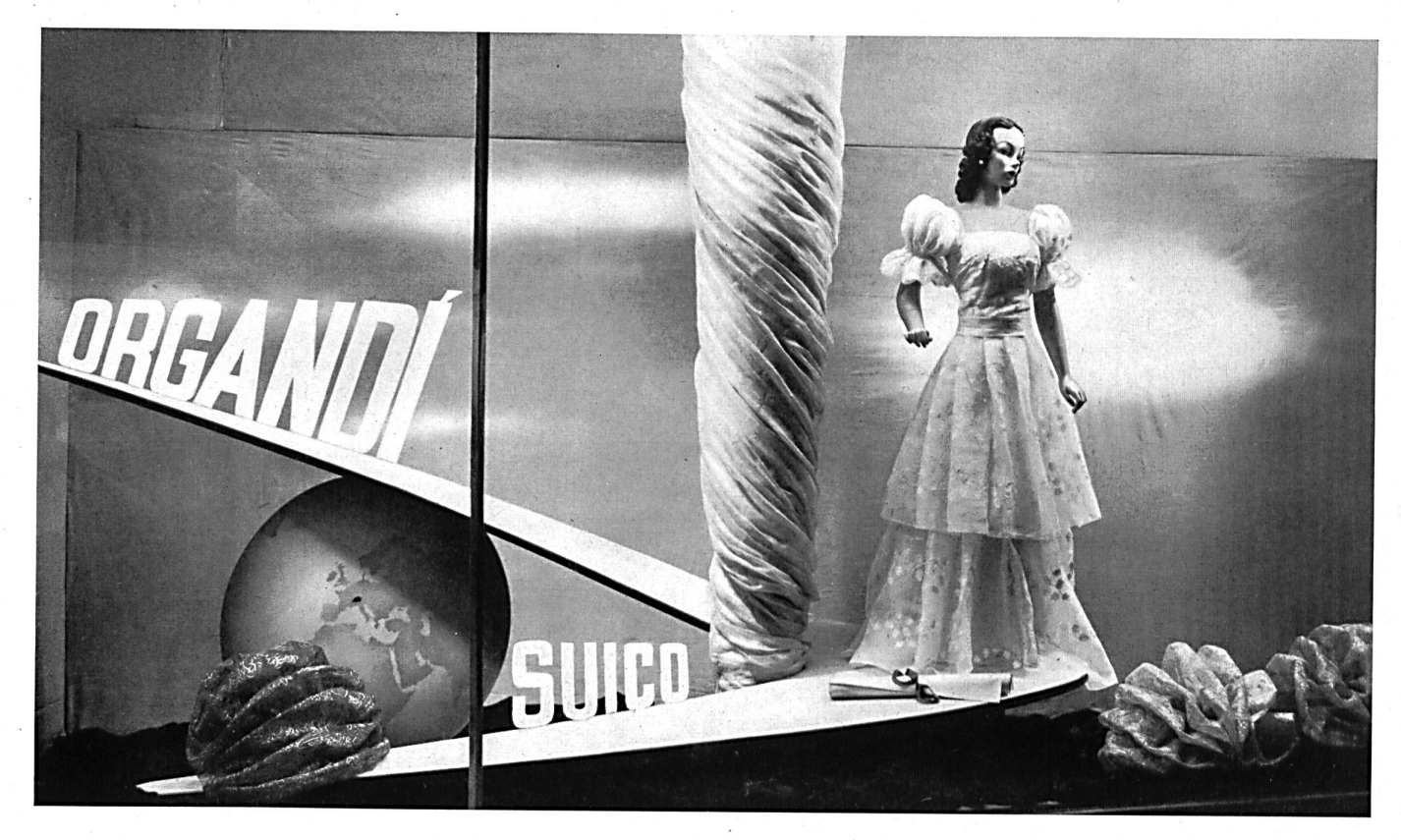
Swiss fabrics in Brazilian shop-windows