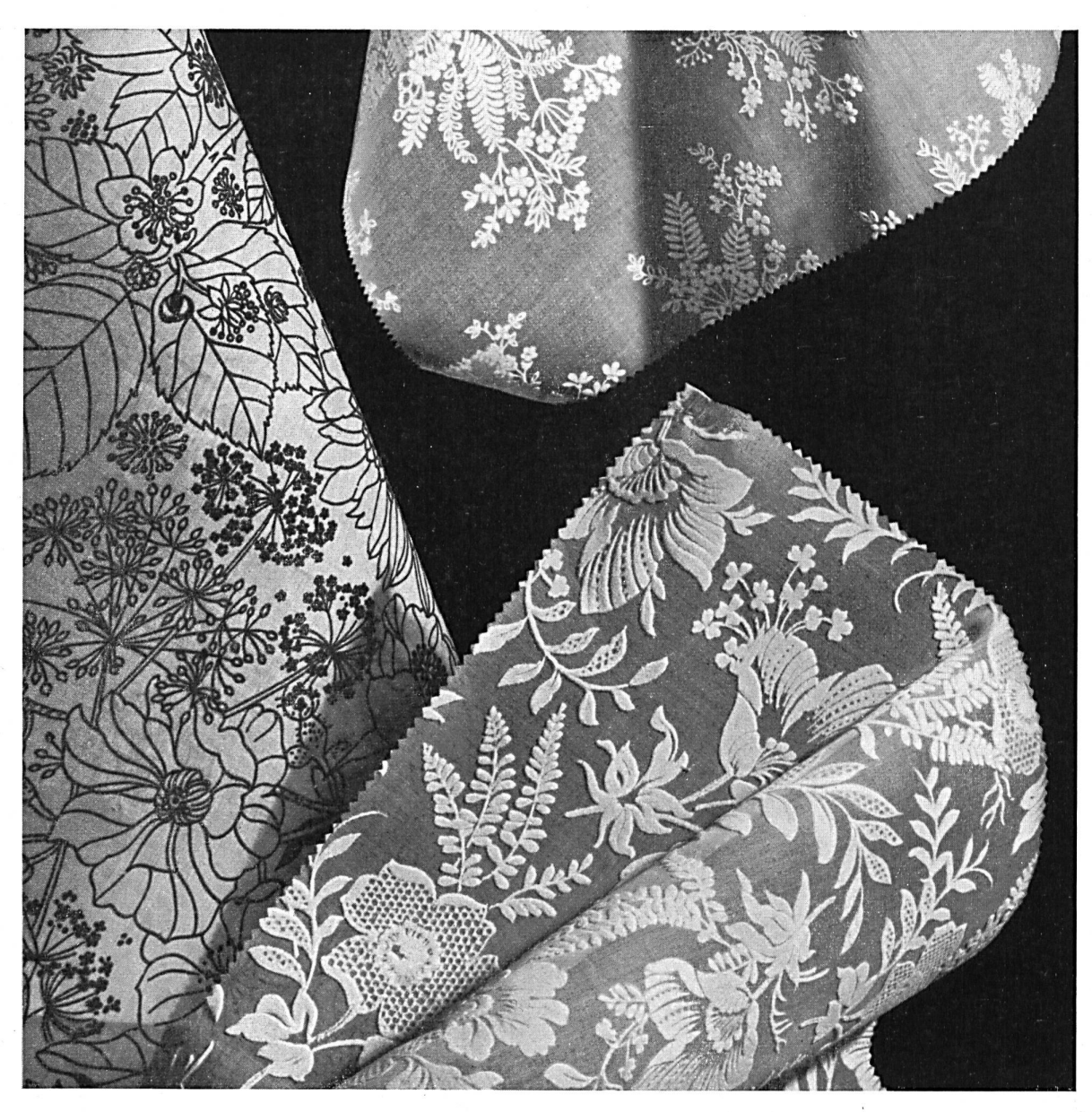
Hausammann & Co., Winterthour Some samples from the flockprint collection on organdic and nylon grounds.