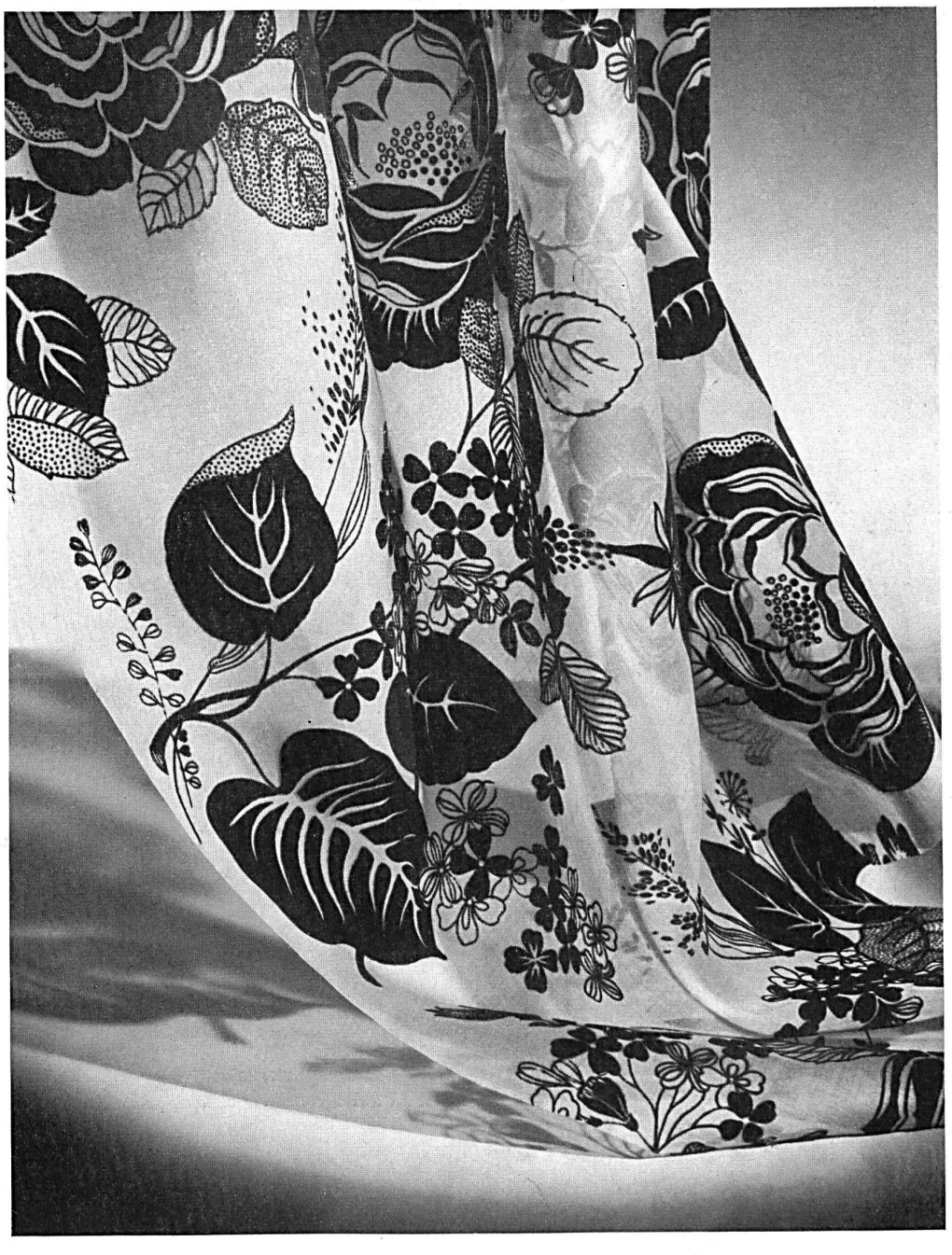
J. G. Nef & Co., Herisau « Neloflock » flockprint on organdie. Black or white velvety effects on coloured fabrics in ten different shades or white on white for bridal gowns.

Now these effects are not obtained by weaving but by printing. The principle of the process has nothing complicated or even secret about it. The design is printed on the fabric with glue and this glue is covered with cropping flock or clippings of textile