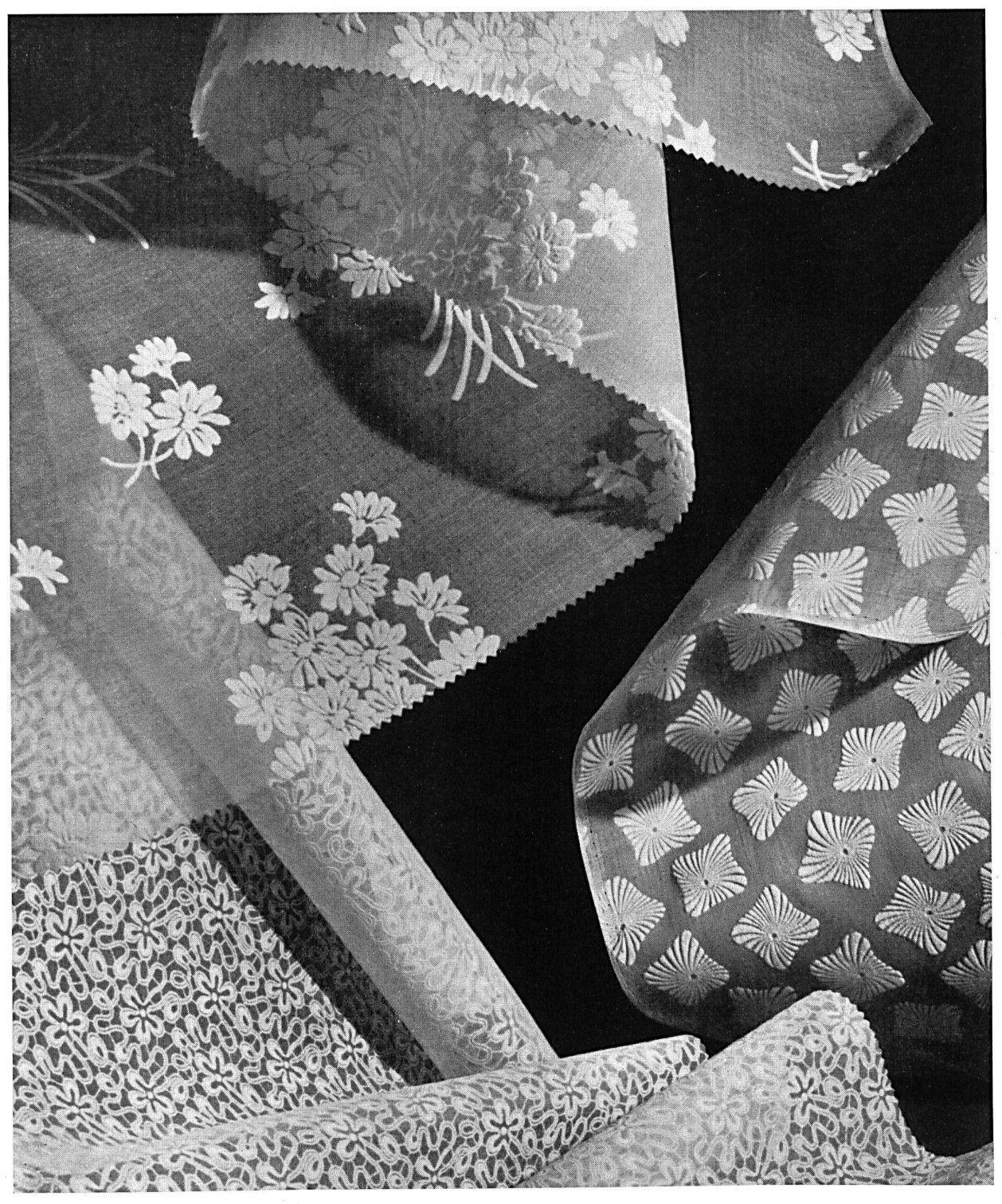
Christian Fischbacher Co., Saint-Gall « Mimosa », fabrics with velvety effects on white or fashionably coloured ground for smart summer dresses and blouses.