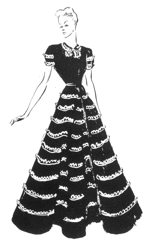
Dark blue organdy with pale lace let in. Paquin.

the picture. The exhibition of English art which took place in Paris this year has drawn attention to another type of elegance. This classical school shows magnificent, soft dresses forming bright patches of colour against the dark background of trees and bushes, or adding more light to the fresh verdure of spring, – all of them bearing the stamp of subtle distinction.