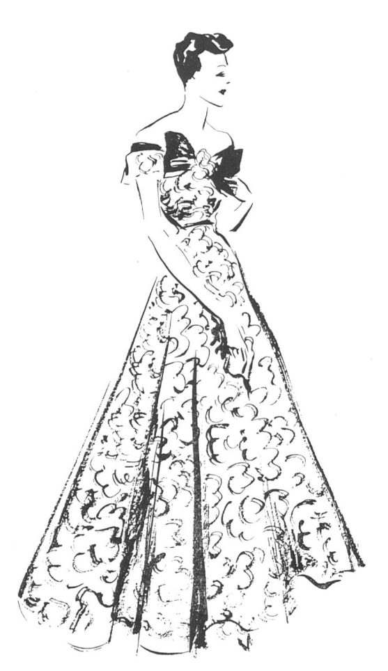
White interwoven organdy trimmed with black velvet and camelias. Robert Piguet.

Embroidery of different kinds is let into dinner dresses, while lace insertion is wound in spirals round stylishly cut dresses, and is also used for transparent edgings on fine silk stockings.