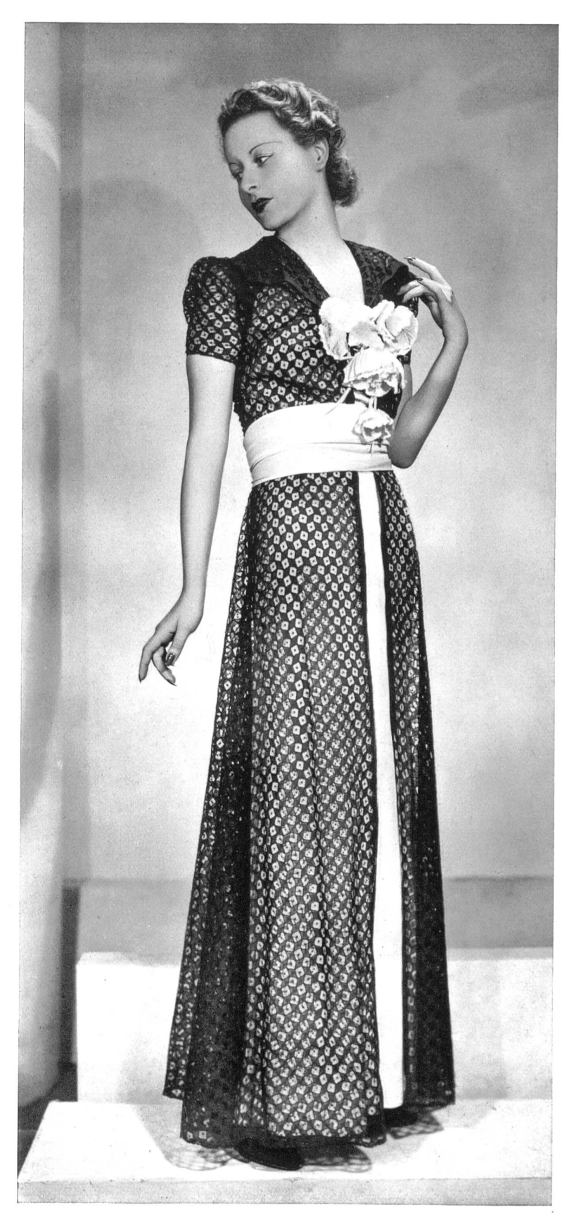
Embroidered organdy dress. Paul Roy, Paris.