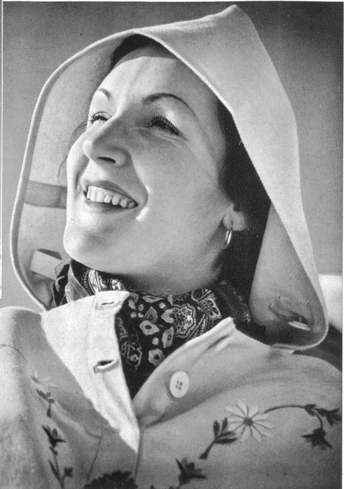
Models « Schwyzerli » Creations Picard, Lausanne - St-Moritz.