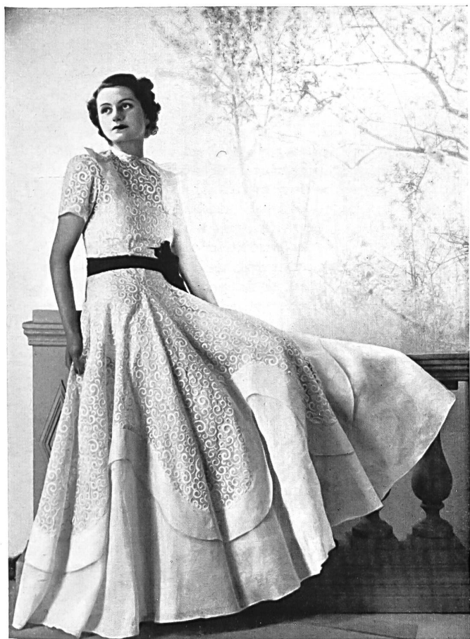
A Agnès Drecoll Model.

A certain Heim-Jeunes-Filles model is most desirable. It is of lawn embroidered with long wavy lines of drawn-thread work and is charmingly youthful. The skirt is short and full and flutes gracefully; the bodice, gathered at the waist