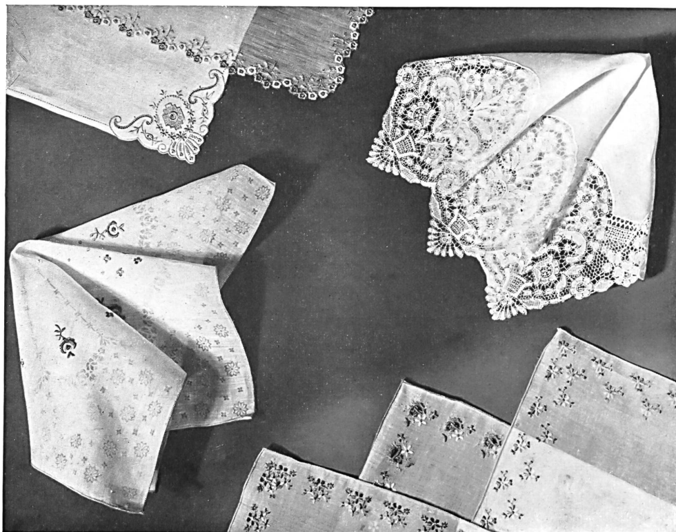
Ladies embroidered handkerchiefs created by P. Messmer & Co., St. Gall.