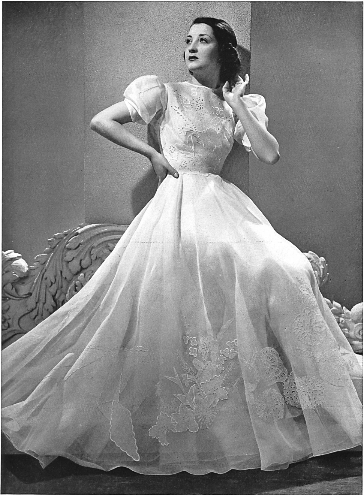
Model Ardanse, Paris. Tissue created by Union Co. Ltd., St. Gall.

But Fashion, an ever-faithful follower of the edicts of Progress, always adapts itself to the actual tendencies of the moment. Thus it is not surprising that one of the greatest successes of today is the dress executed in Broderie Anglaise. Charming effects can be achieved by the clever assortment of bright designs on dark grounds, such as a brown ground embroidered with lemon, or a navy-blue embroidered with rose, with pale-blue or white.