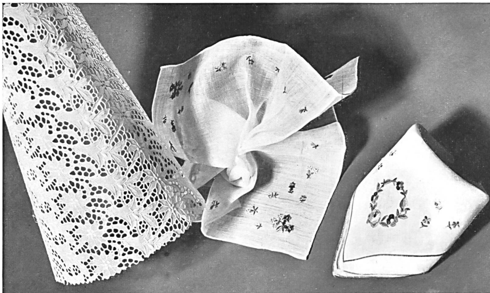
Handkerchiefs and allover created by Ed. Sturzenegger Ltd., St. Gall.

Fine Valenciennes incrustated on gauzy materials, garlands executed in lace, saucy little bouquets clinging to the dresses like sleeping butterflies, rich golden galloons of lace placed on black tulle and many other beautiful and fanciful creations defying description