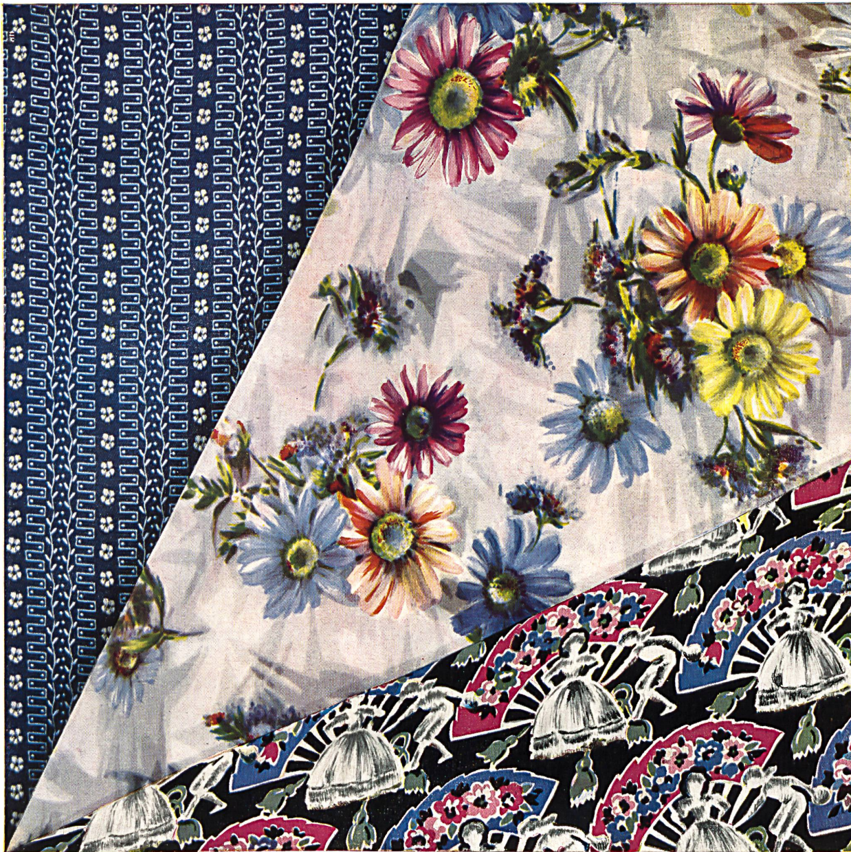
Dress materials by Robt. Schwarzenbach & Co., Thalwil. Edwin Naef Ltd., Zurich. Siber & Wehrli Ltd., Zurich