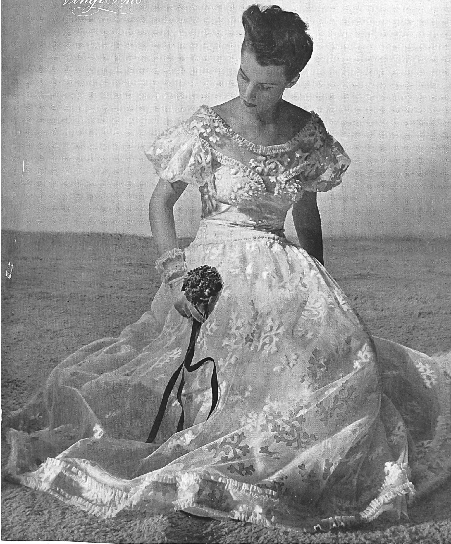
« Varech d'or » : Sauvage-Couture. Gold embroidered tulle with applications by Tul bordado de oro con aplicaciones de A. Naef & Co., Flawil