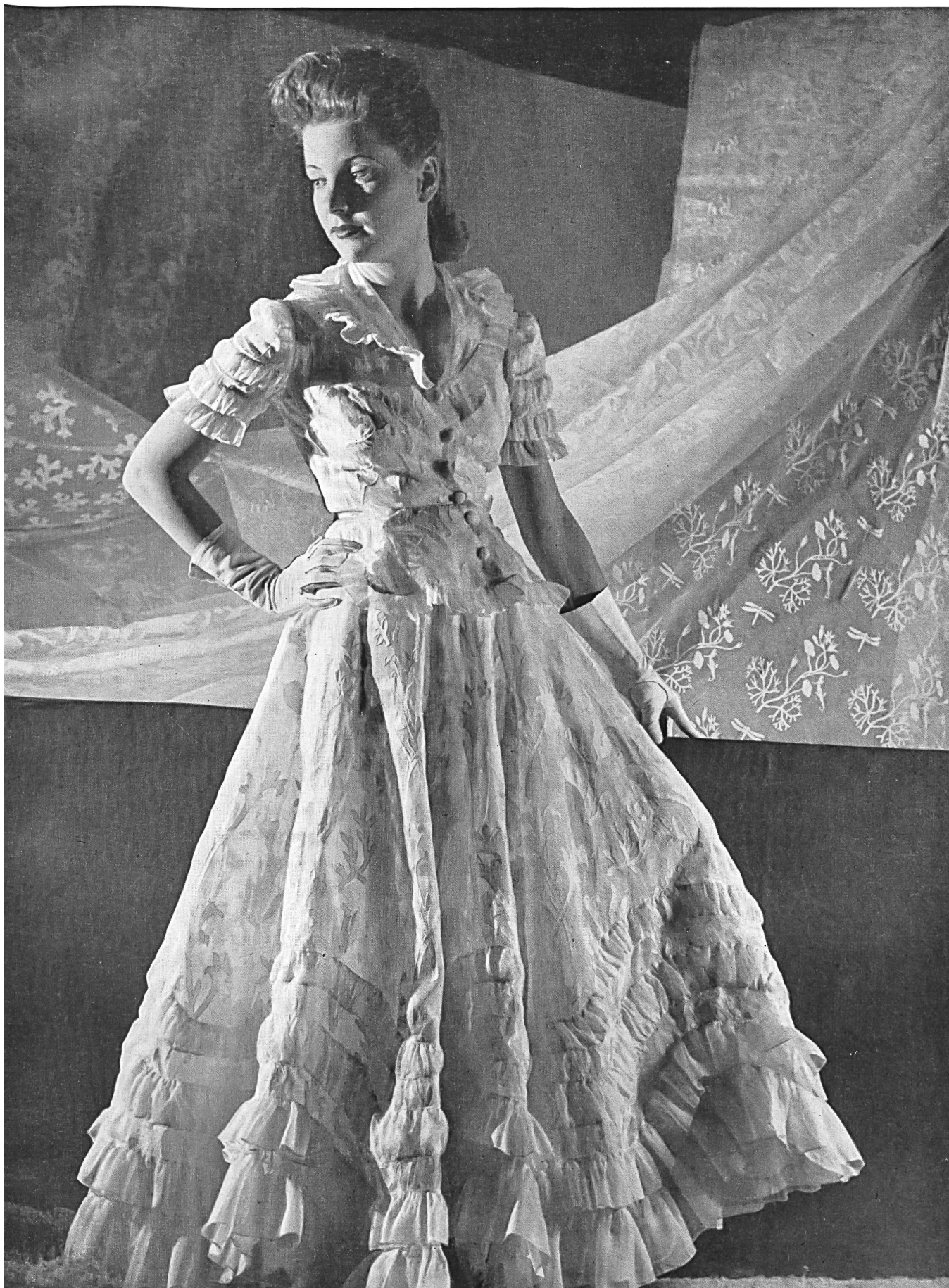
« Algues blanches » : Andrée Wiegandt. Lawn with applications of white nainsook : Linón con aplicaciones de nanzú blanco : Bischoff & Muller Ltd., St. Gall.