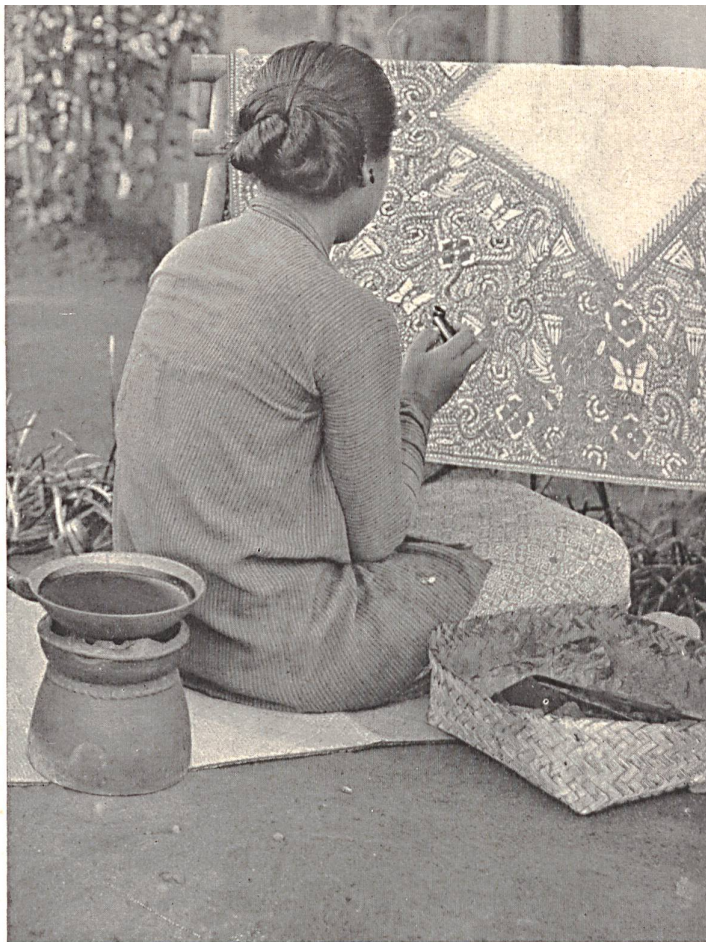
Reichenbach & Co., St. Gall.

The best-known Javanese « batik » products are : the sarong , the typical native garment, worn by men, women and children alike. It is a strip of cloth