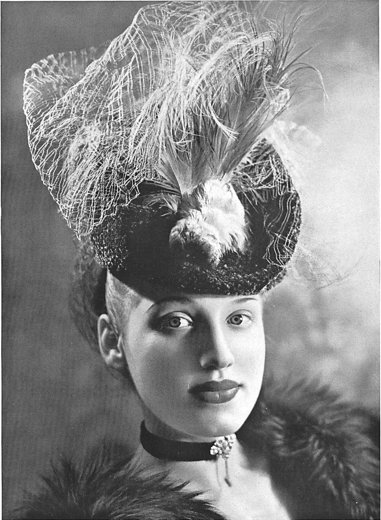
Jacques Isler & Cie S. A., Wohlen. Modèle Charles Muller S. A., Zurich.