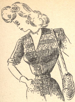
3. Mc Cutcheon's model in dotted Swiss.

satisfied to buy any old fabric provided it is in a pretty shade. The perfection of the material and of the processes which go into its manufacture — weaving, finishing, dyeing — is a fundamental quality which confers real value to a material and inimitable chic to a gown. And this perfection is precisely what Swiss manufacturers can give to women of taste, to those who appreciate true elegance.