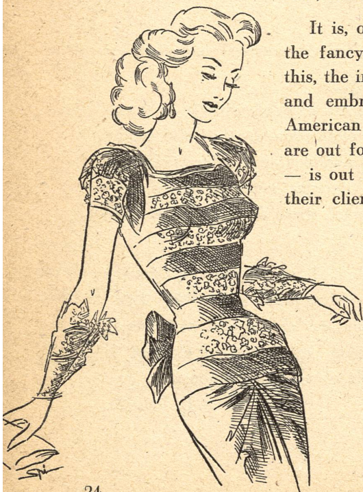
2. Evening gown. An original creation by Boué Sœurs. «Glamorous Evening»: gold lace and brown tulle bodice over brown taffetas with draped and knotted bustle effect at the back.

It is, of course, in evening styles — long ball and dinner gowns — that the fancy of designers is most free to express these new trends. And, in this, the incomparable quality of the silks, fine rayon lawns, organdies, laces and embroideries imported from Switzerland, is an invaluable asset for American fashion houses. (Fig. 2). Nor should it be forgotten that, if fashions are out for effect , the American woman, so long deprived of luxury articles — is out for quality . American wholesalers and retailers are all saying that their clients have become quality conscious and that they are no longer