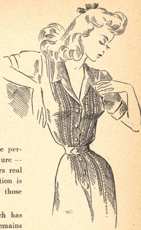
3. Mc Cutcheon's model in Swiss, imported rayon lawn.