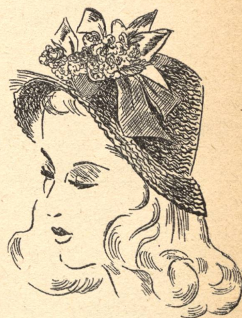
4. Swiss straw millinery model by K. G. Hat Mfg. Co.