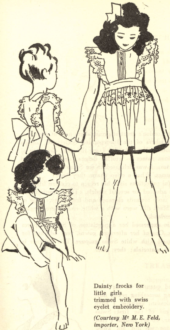
Dainty frocks for little girls trimmed with swiss eyelet embroidery.