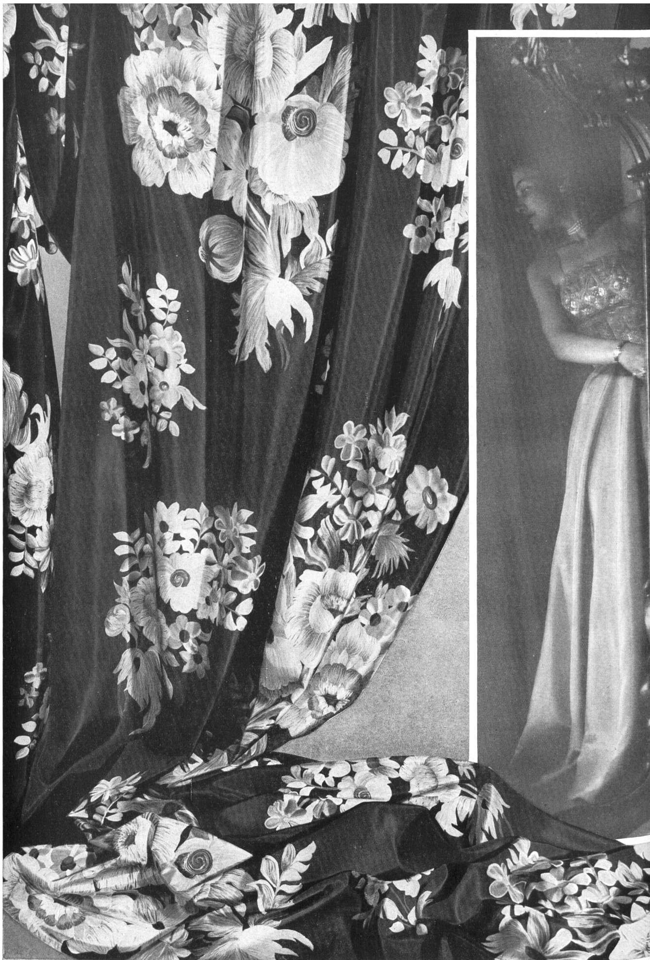
Fabrique de Soieries ci-devant Edwin Næf S. A., Zurich. Impression „Orbis“ sur Poulte de Soie. „Orbis“ Print on Poulte de Soie. Impresión „Orbis“ sobre Poulte de Seda. „Orbis“-Druck auf Poulte de Soie.

Satin Duchesse rayé. Satin Duchesse imprimé. Raso Duchesse listado. Raso Duchesse estampado.