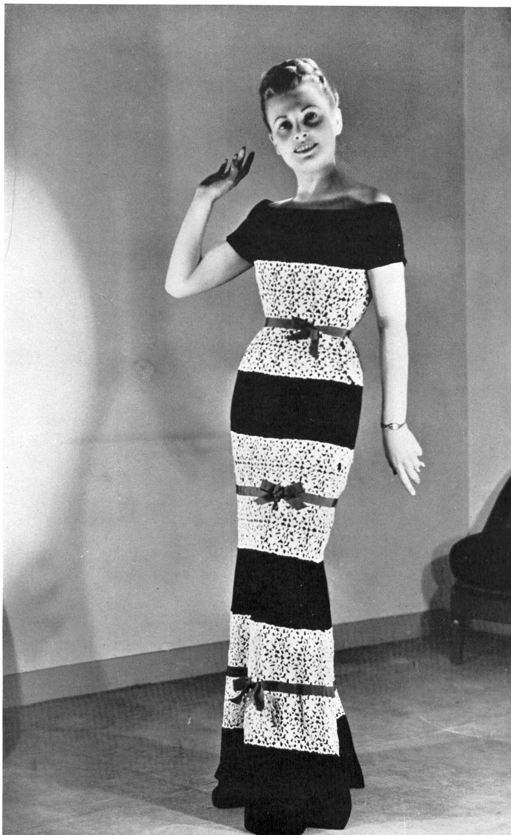
JEAN PATOU Aug. Giger & Cie, St-Gall