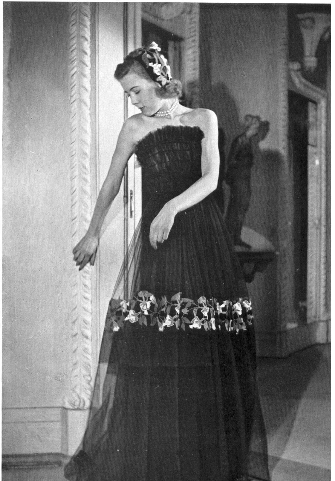
BRUYÈRE Forster Willi & Cie, St-Gall