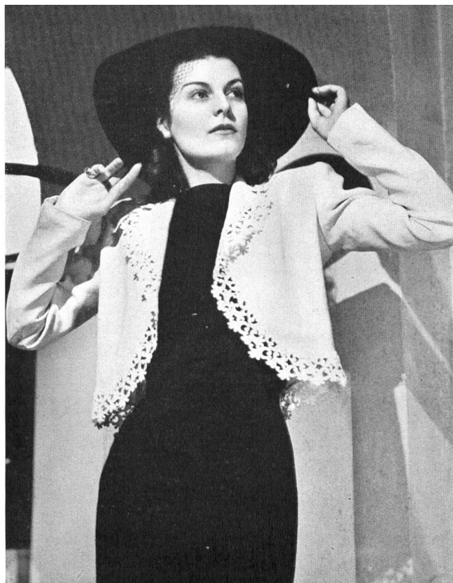
JEANNE LANVIN Aug. Giger & Cie, St-Gall