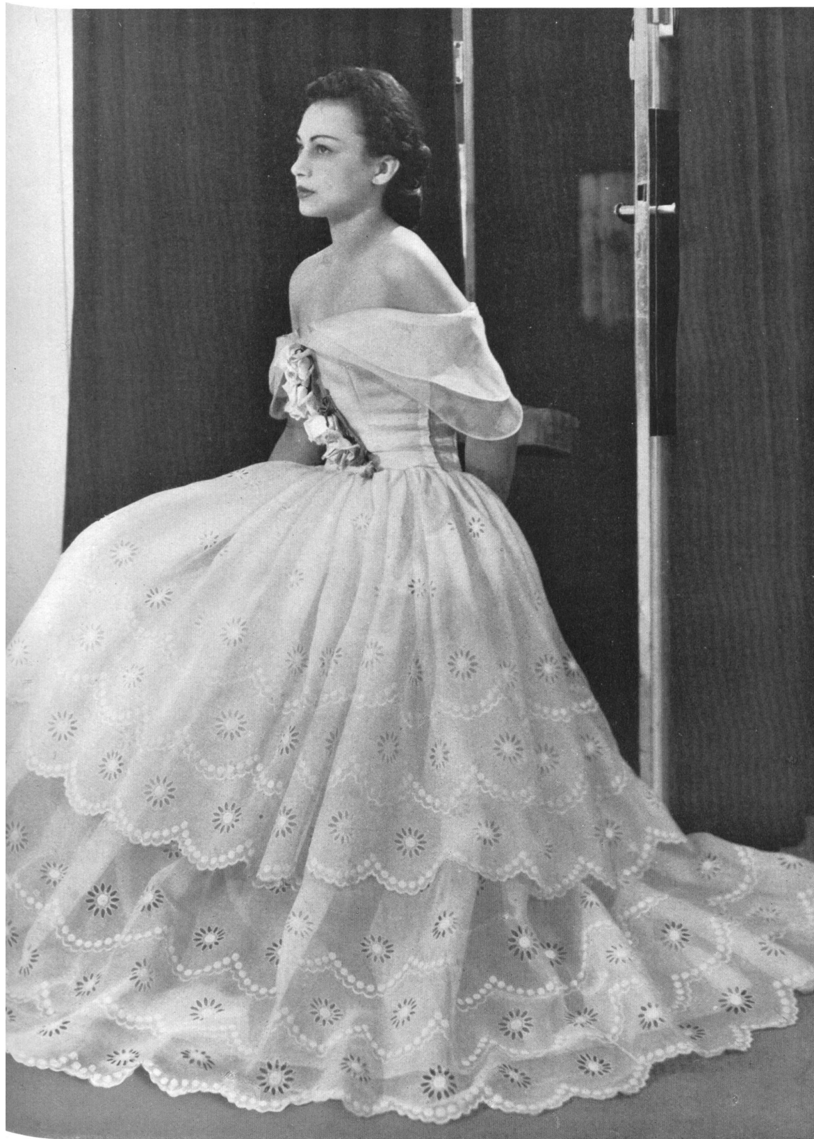
JEANNE LANVIN J. G. Nef & Cie, Hérissau