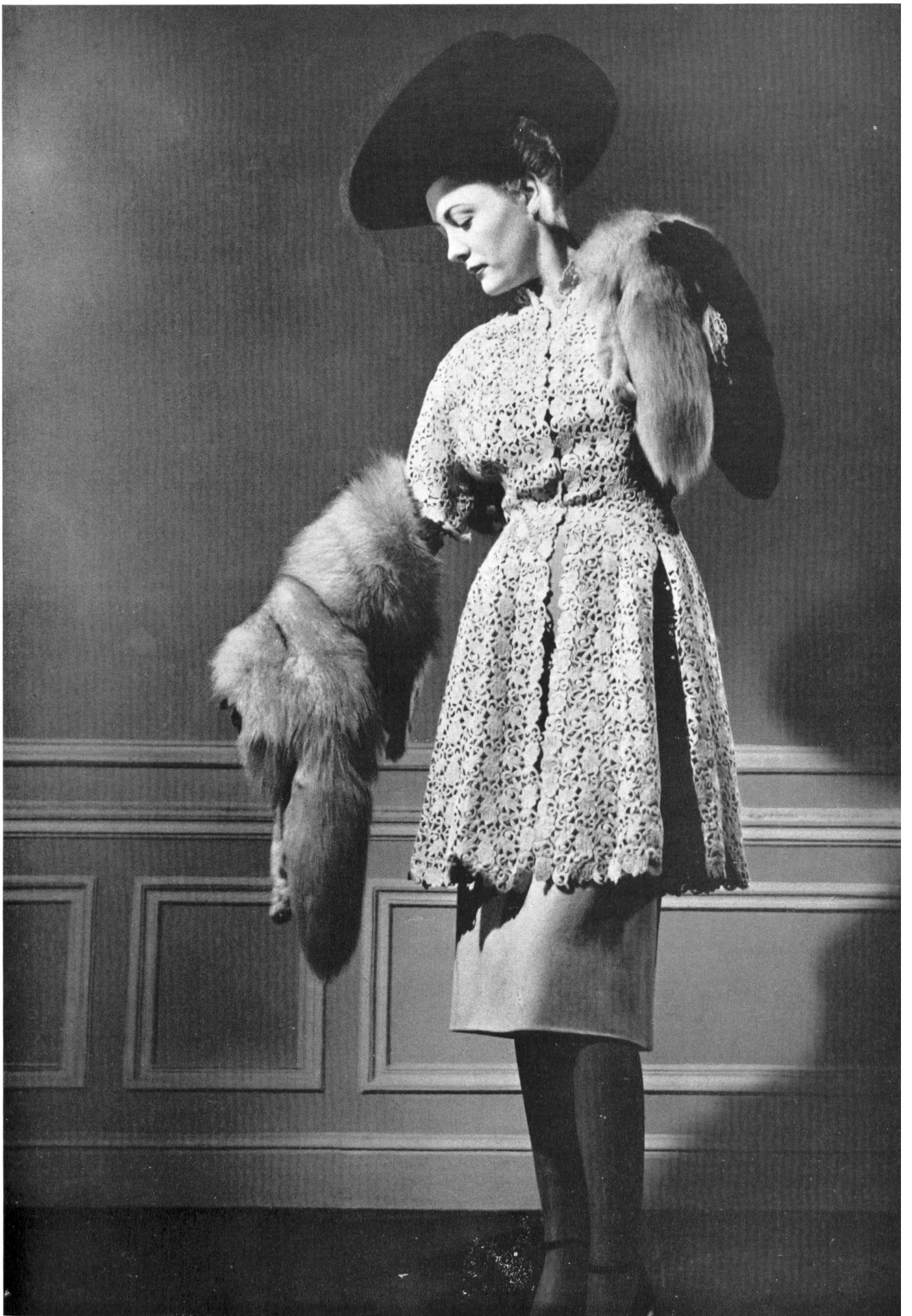
PIERRE BALMAIN Union S.A., St-Gall