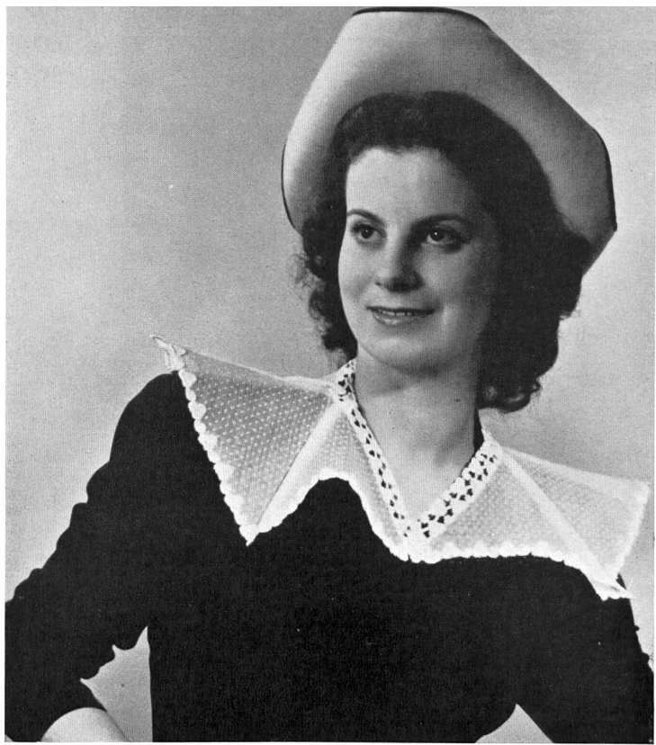
KROUPINE Union & Cie, St-Gall Aug. Giger & Cie, St-Gall