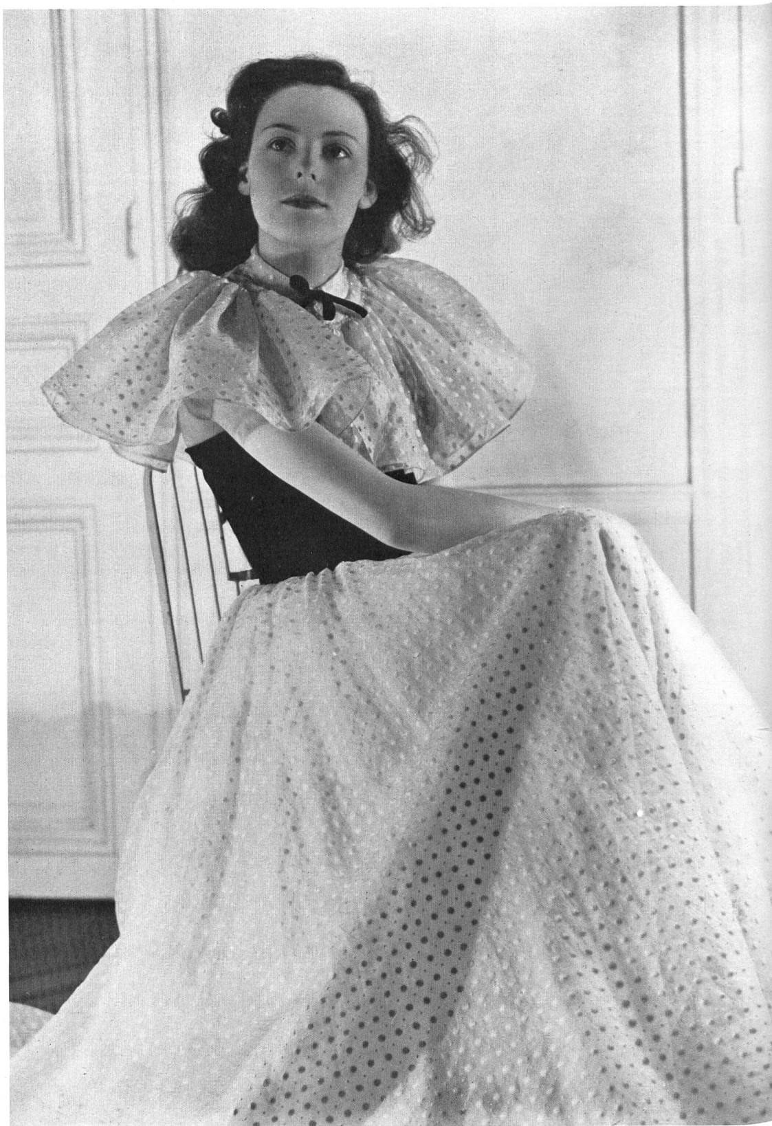
JACQUES GRIFFE Union S.A., St-Gall