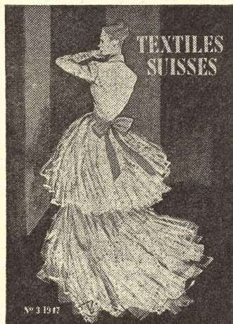
CHRISTIAN DIOR Forster Willi & Cie, St-Gall. Stoffel & Cie, St-Gall.

T he fashion this season seems to call for nothing but the frothy billows of organdies and muslins and it is doubtless the sign of a break-away from austerity, a reaction against sport styles which demanded that, from morning to night, women should be garbed in tailormades. Feather-stitching, St. Gall embroideries lend a romantic air to the most vaporous and ethereal of gowns of which even a Gainsborough lady might have dreamt. Like snow flowers they flutter, luminously unreal, in summer twilights; they can only be described in tones hushed and subdued and one feels that any description of them should be preceded by the fairytale « Once upon a time... »