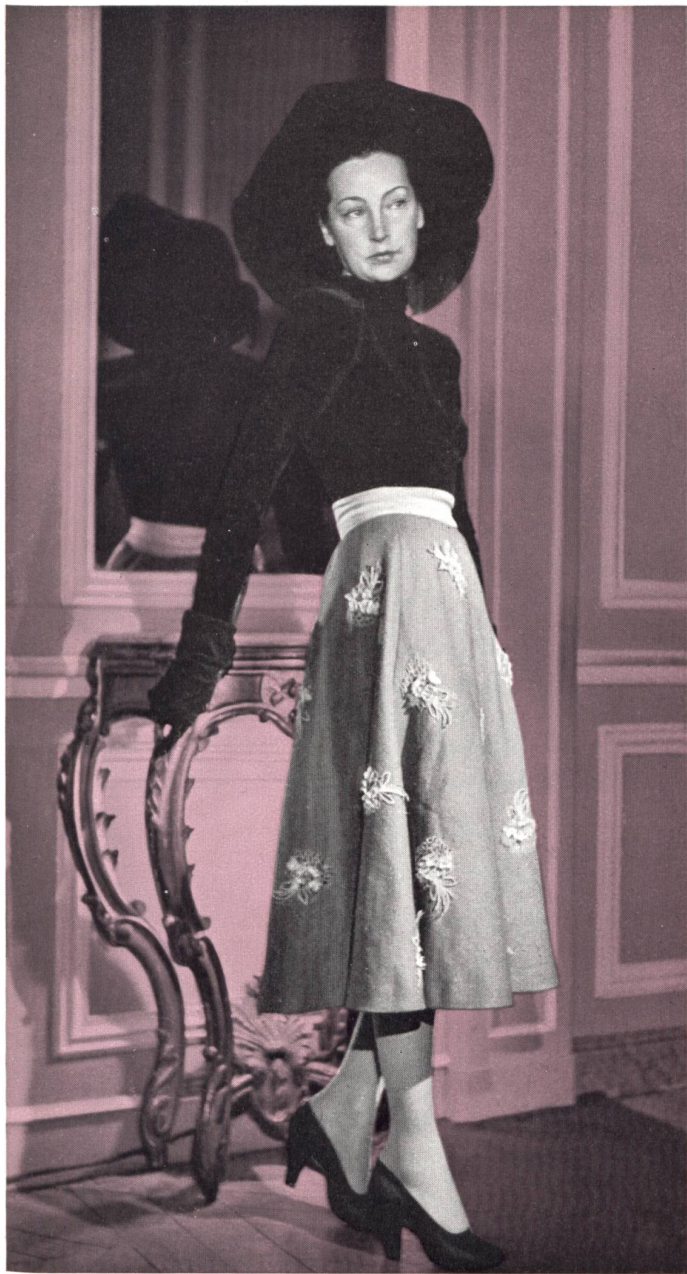
JACQUES FATH Forster Willi & Cie, St-Gall