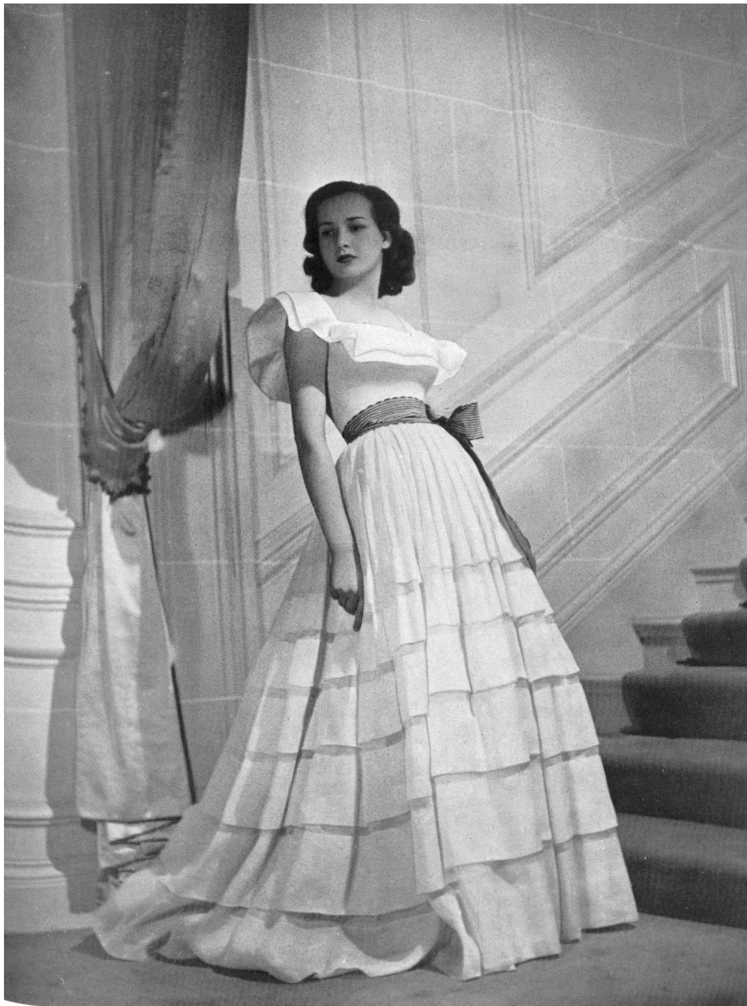
CHRISTIAN DIOR Organdi blanc de St-Gall