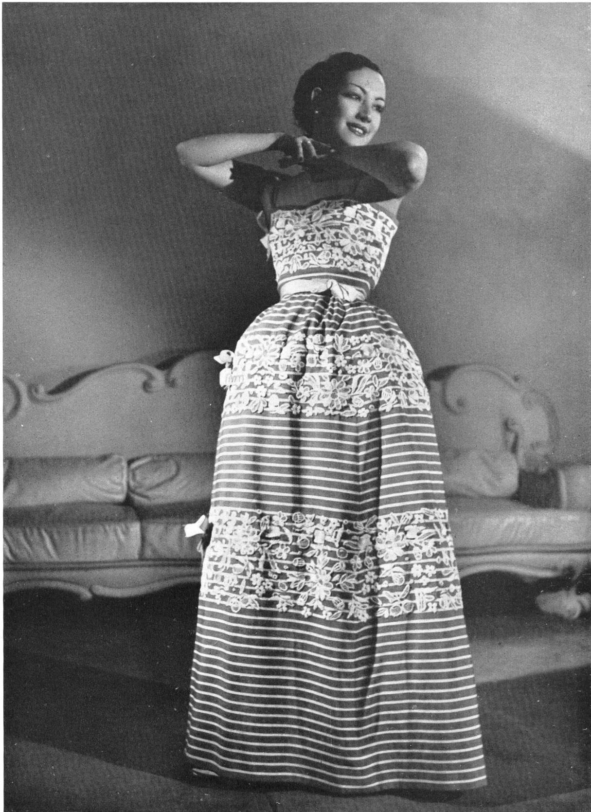
BALENCIAGA Walter Schrank & Cie, St-Gall