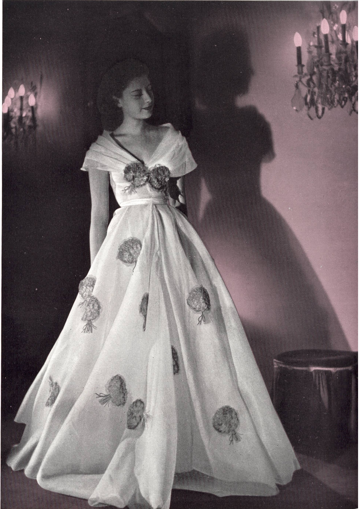
NINA RICCI Forster Willi & Cie, St-Gall