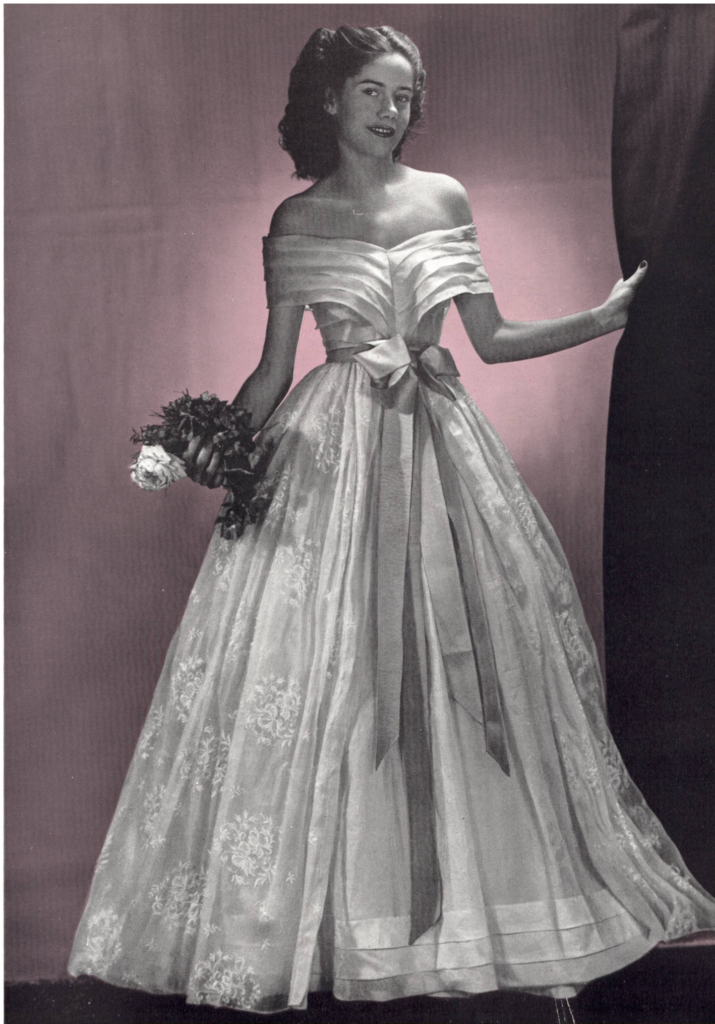
MAGGY ROUFF Forster Willi & Cie, St-Gall