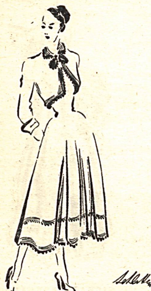
A Fred Schlatter model in Swiss fabric