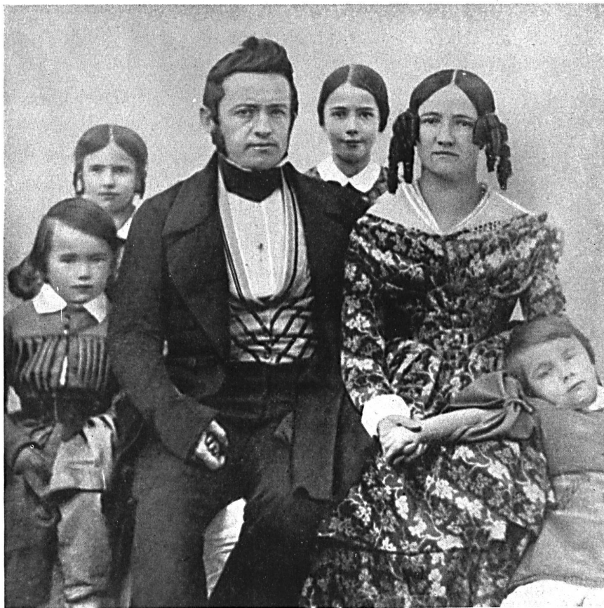
Jonas Furrer, the first President of the Swiss Federal State, with his family.

It is due to this neutrality and to the sacrifices which the people of Switzerland accept in favour of the national army, that the humanitarian work of the International Red Cross Committee in Geneva has been rendered possible in the course of several wars. It is clear that the second World War laid a very heavy burden on the shoulders of this small nation : apart from the military refugees which entered