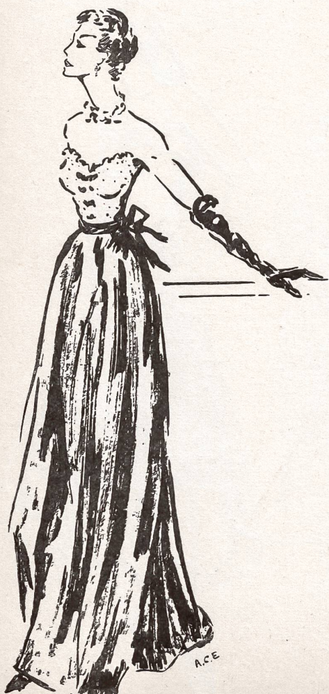
Dinner dress with soft black skirt and camisole top of Swiss Broderie anglaise , by Spectator Sports, London.