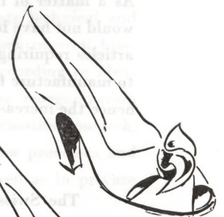
« New-York »