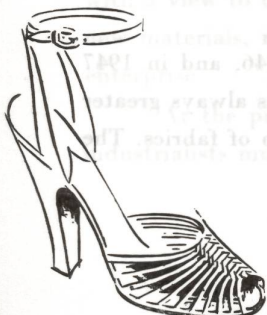
« Paris »