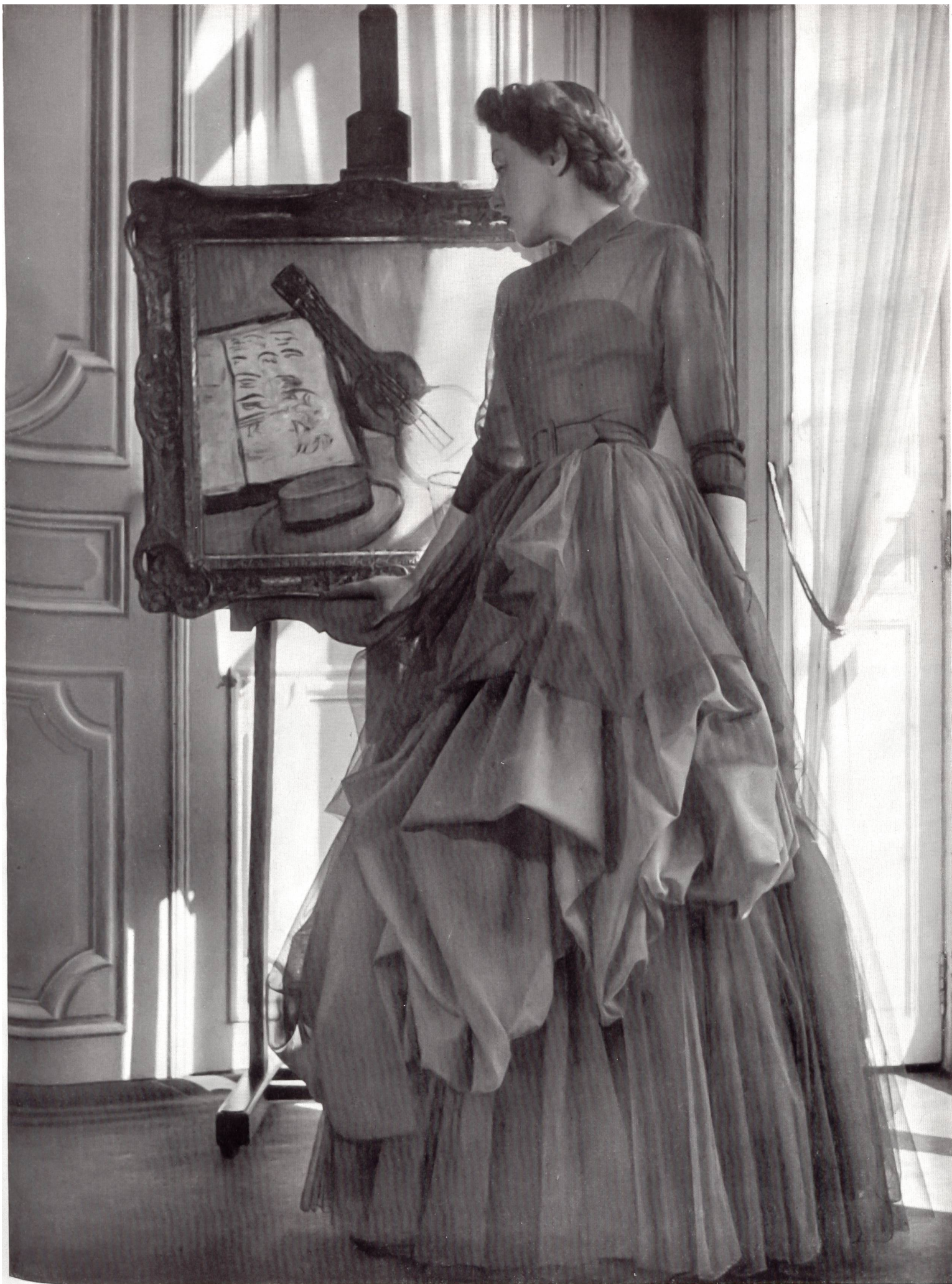
RAPHAEL Heer & Cie S. A., Thalwil INAMO, ZURICH