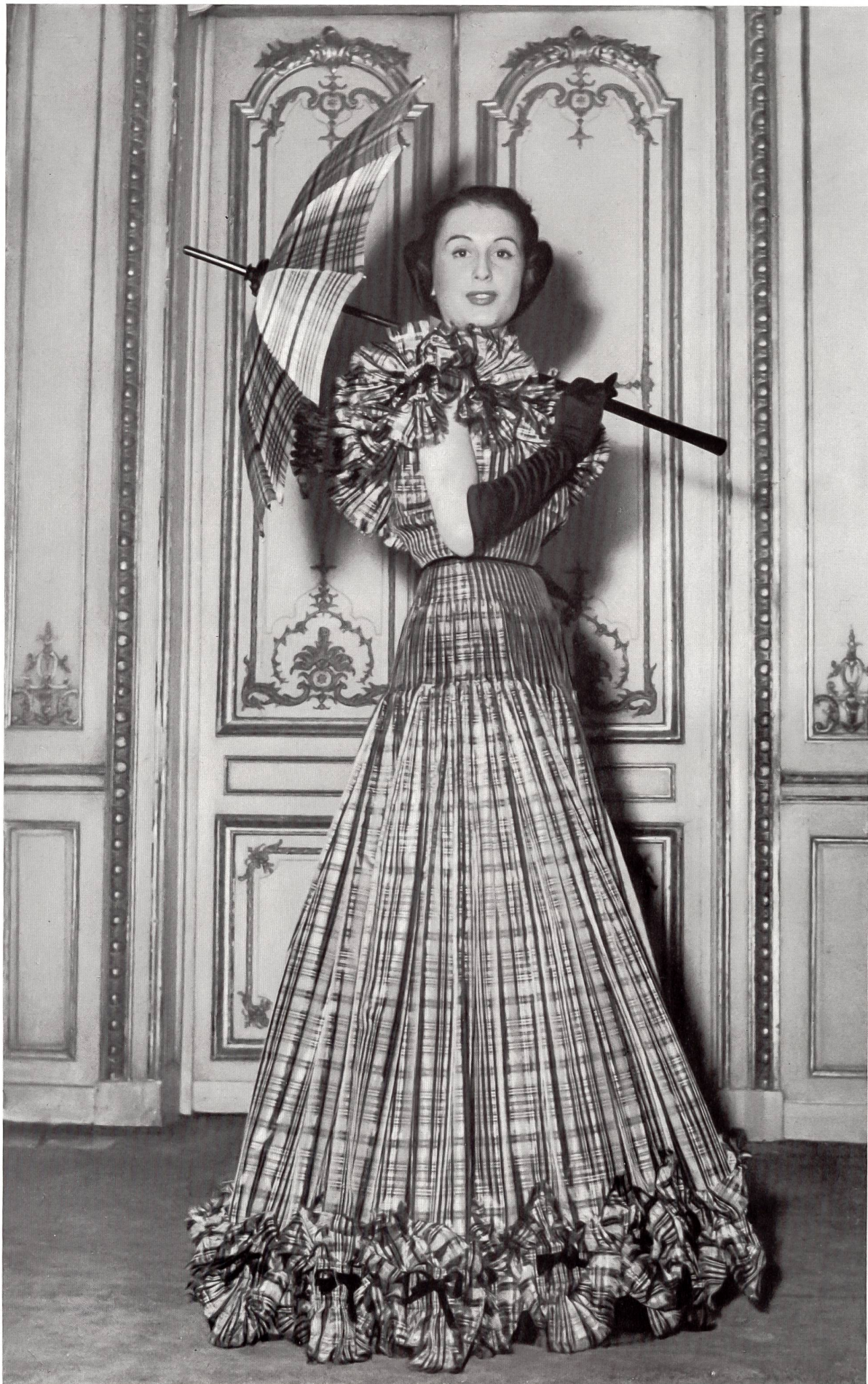
MARTIAL & ARMAND Rudolf Brauchbar & Cie, Zurich