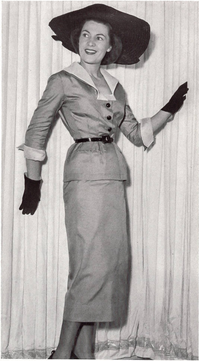
MARCEL ROCHAS Rudolf Brauchbar & Cie, Zurich