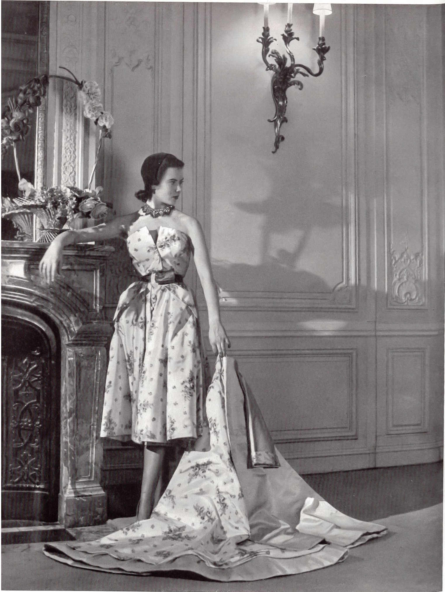
CHRISTIAN DIOR L. Abraham & Cie, Soieries S. A., Zurich