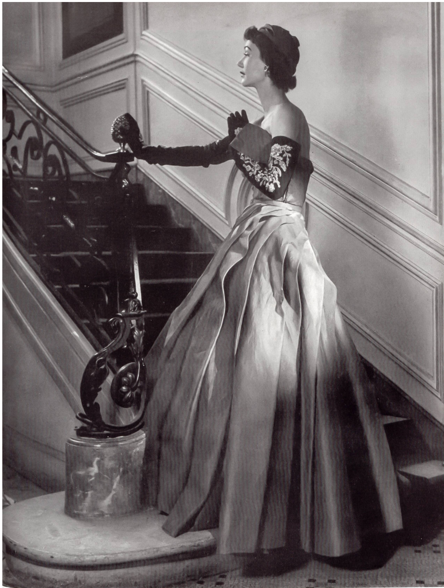
JACQUES FATH L. Abraham & Cie, Soieries S. A., Zurich