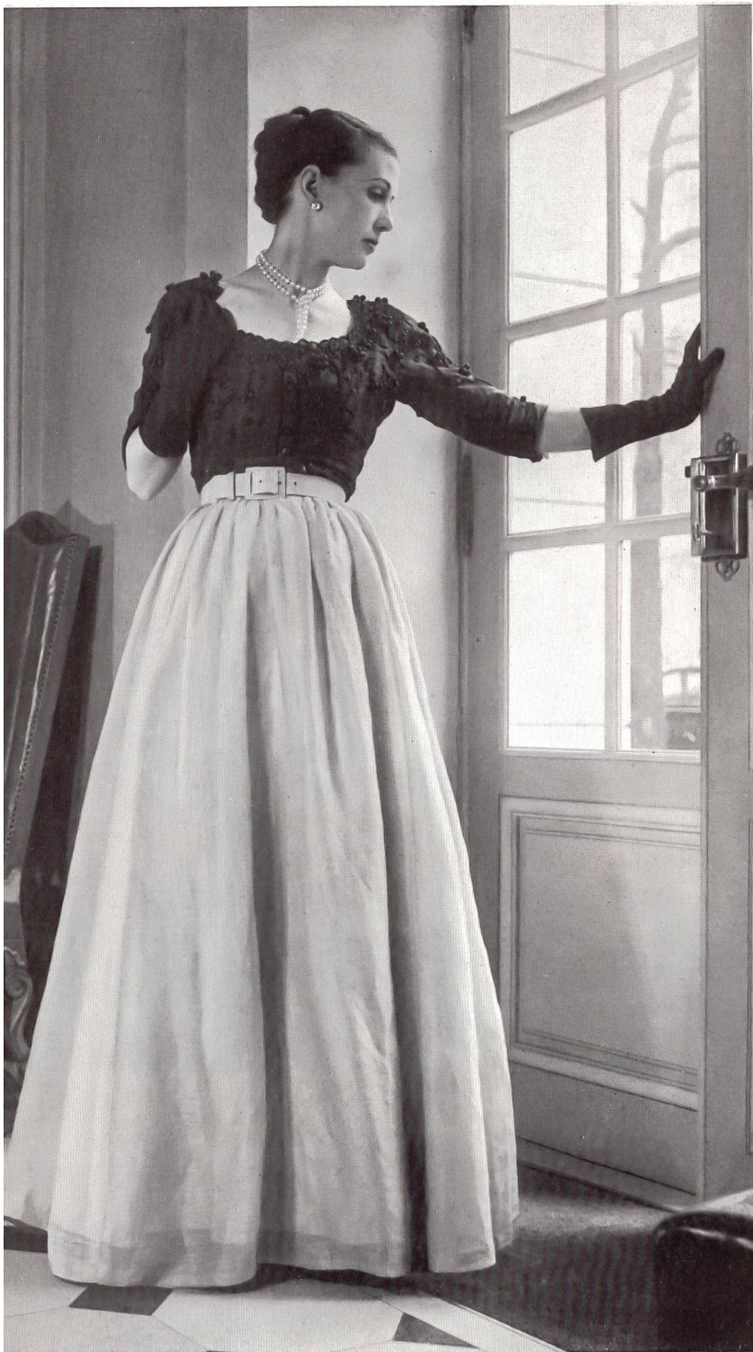
BALENCIAGA Heer & Cie S. A., Thalwil INAMO, ZURICH