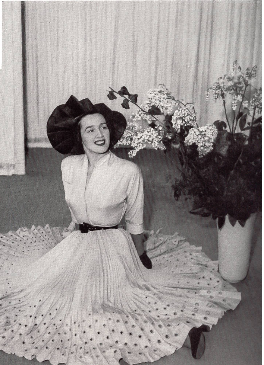
MARCEL ROCHAS Rudolf Brauchbar & Cie, Zurich