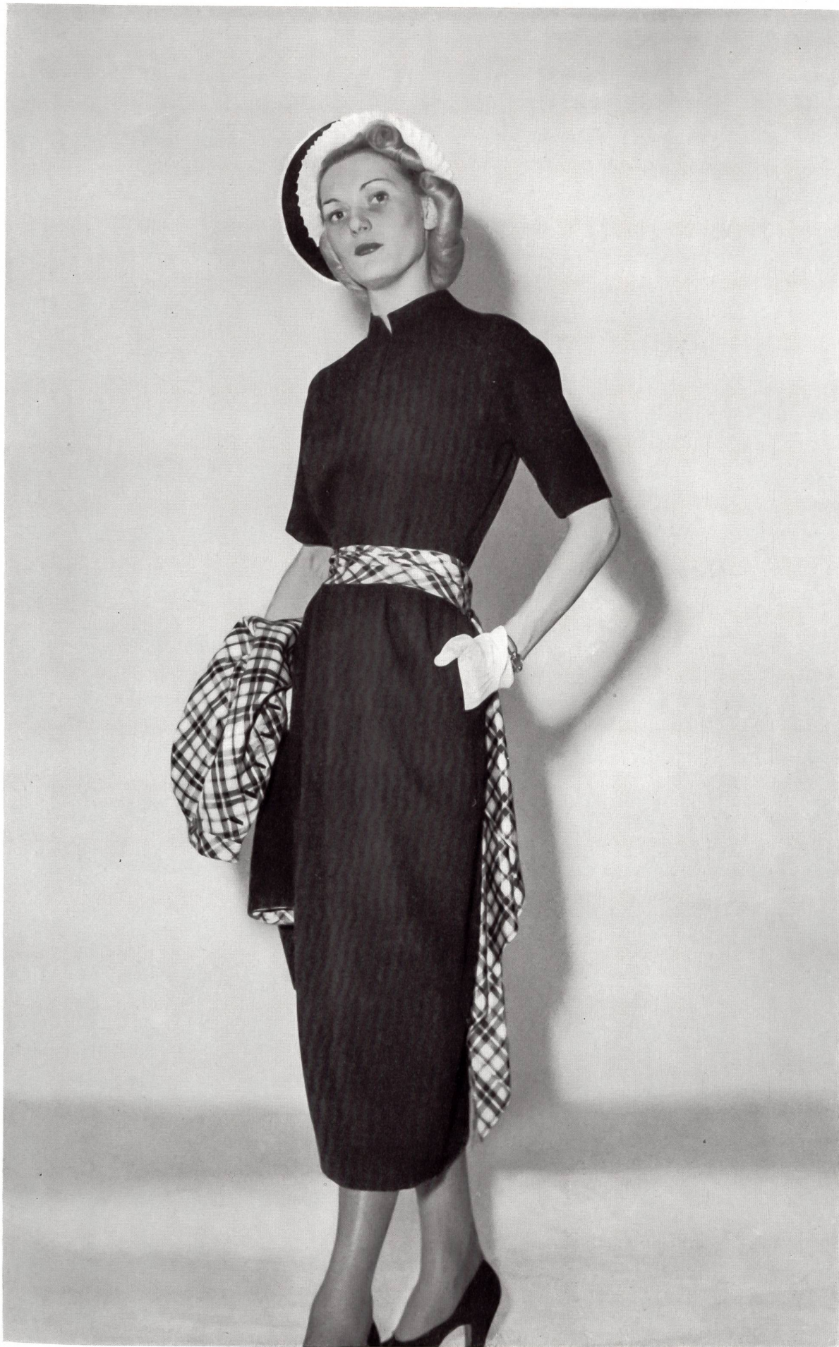
MOLYNEUX Rudolf Brauchbar & Cie, Zurich