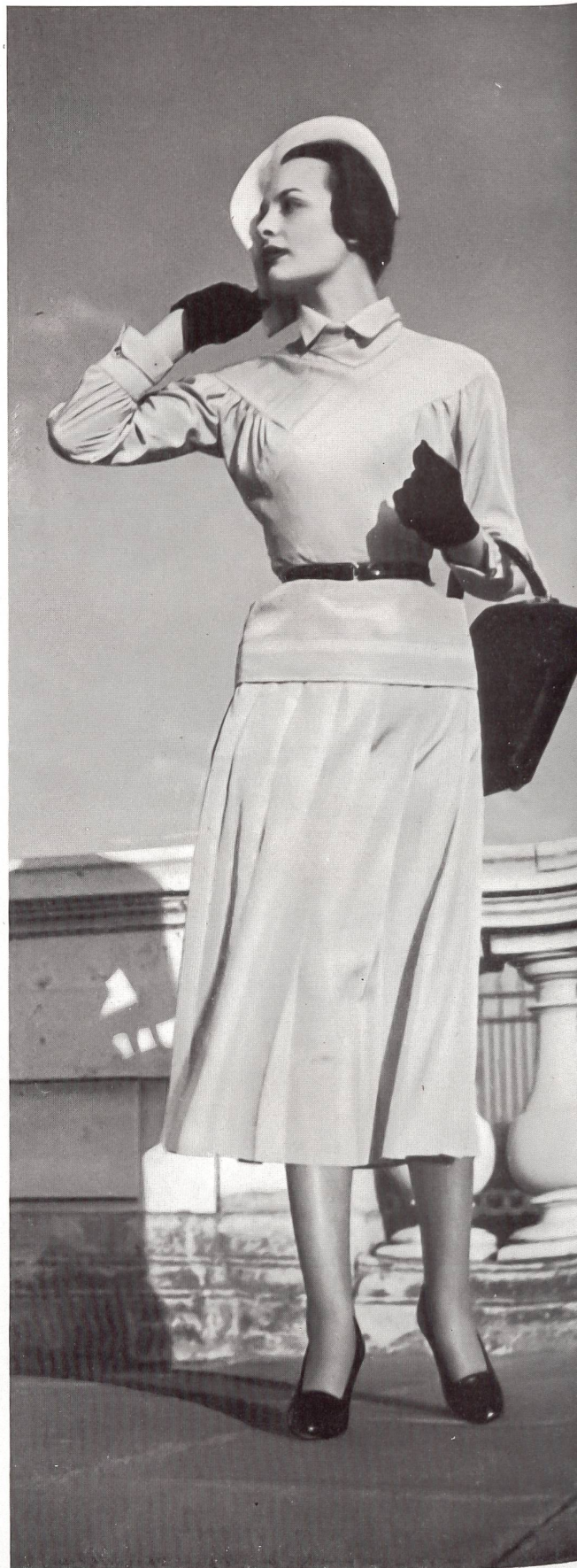
JEAN DESSÈS Heer & Cie S. A., Thalwil INAMO, ZURICH