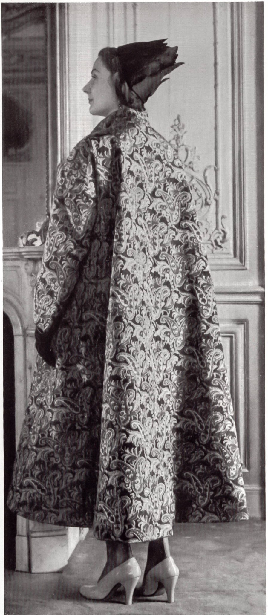
SCHIAPARELLI L. Abraham & Cie Soieries S. A., Zurich