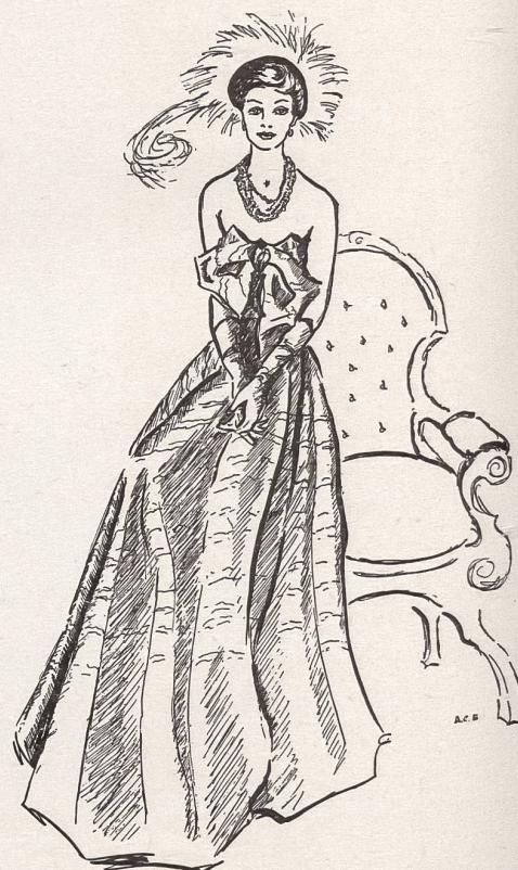
Roecliffe & Chapman, Londres. Evening dress of swiss plissé satin.