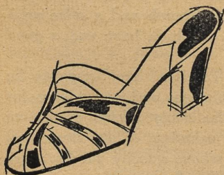
BALLY - Modèles déposés.