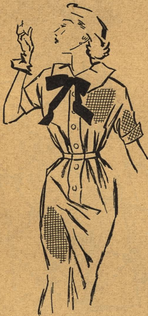
Shirtwaist dress in blue checked taffeta by Mollie Parnis, New York.

Taffeta is popular just now and is being used to make dresses, suits, blouses, linings and a thousand accessories. In the collections of splendid taffetas from Zurich, what is particularly striking is the quality of the fabric, its suppleness and the infinite variety of its colours. Manufacturers have all the