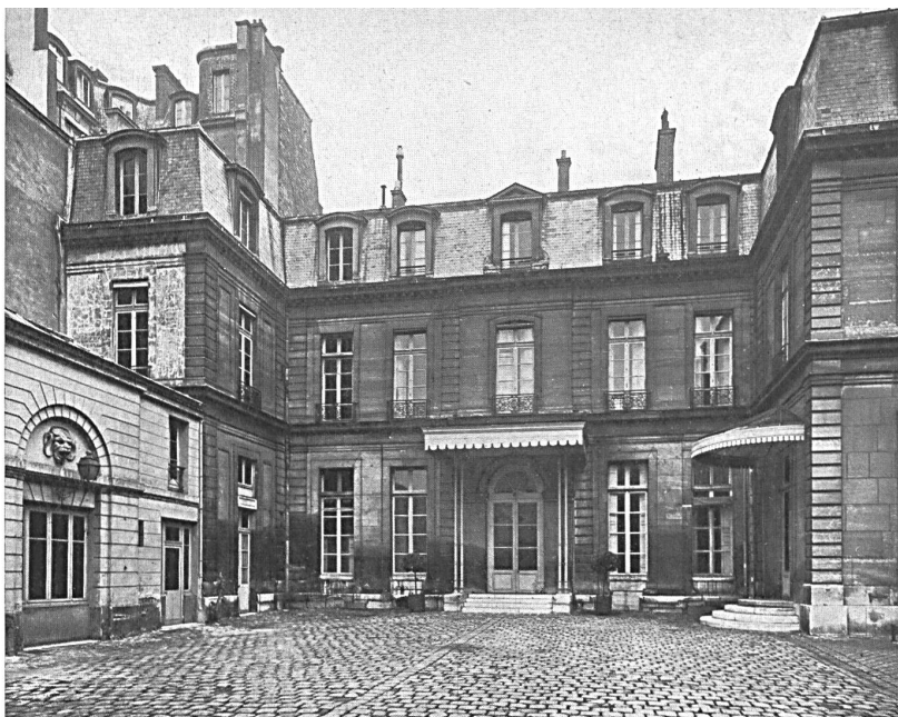
Swiss Legation, Paris, the court-yard facing the entrance.

To complete the picture, let us add that textile products have for long formed a considerable part of the trade between France and Switzerland. Thus, in 1938, total Swiss exports to France amounted to 121.4 million Swiss francs, 13.7 million of which were textile products ; and Swiss imports from France amounted to 229.2 million Swiss francs, 38.1 million of which consisted of