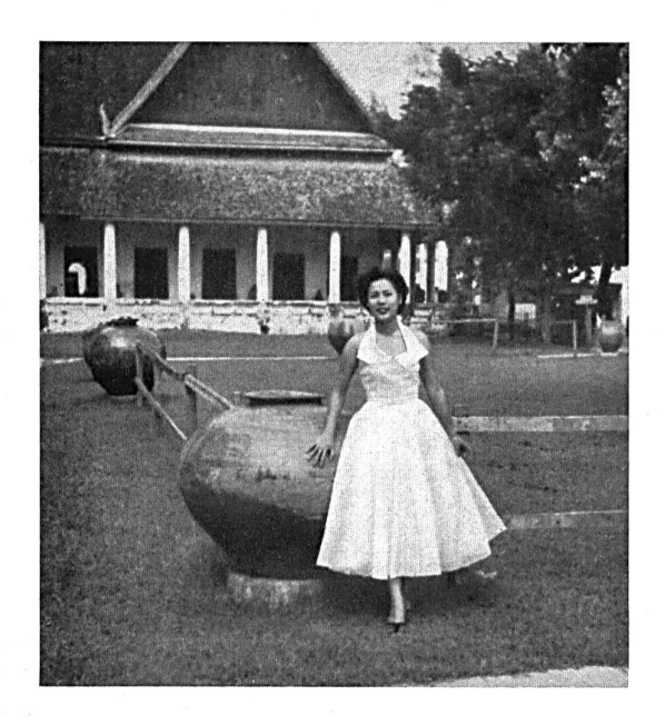
These photographs taken in Bangkok show young Siamese society girls, dressed in Swiss fabrics. One cannot but notice how the whiteness of fine St. Gall cottons enhances the charm of these young Siamese women.