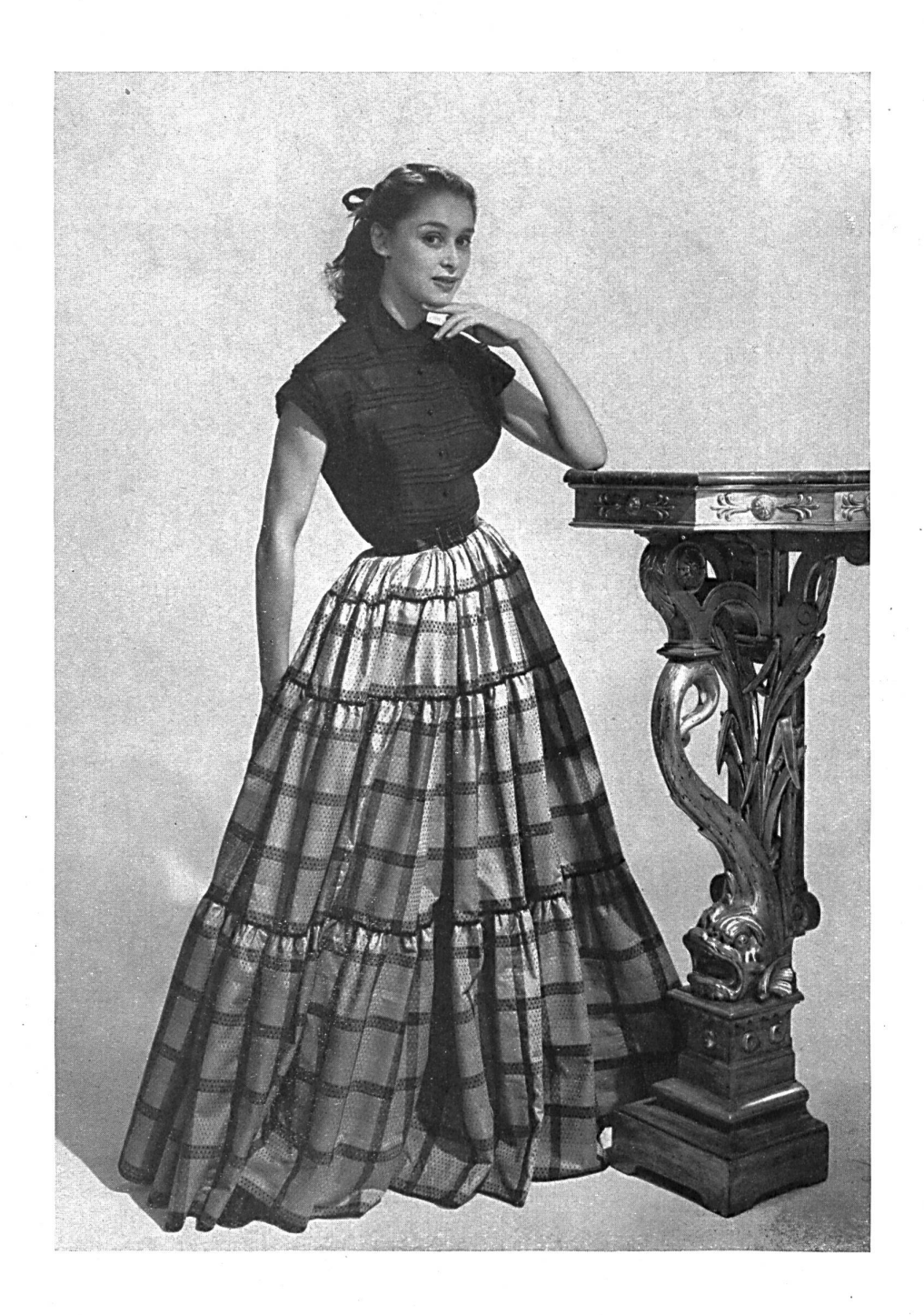
Fancy fabrics of fine Nelo cotton, equally popular in Siam and in Europe, by J.G. Nef & Co., Herisau. Model BAL-MAIN.

remote parts of the country or the resplendent costumes to be seen at theatrical performances, reminiscent of the splendid pageantry of old, cause the visitor to appreciate all the more the splendor of the Siamese costumes, and there can be not the slightest doubt that in the days of Anna and the King of Siam the sight of a crowd presented a magnificent scene. Now and again it is still possible to see some high dignitary or dignified lady wearing the traditional attire, but they belong to the past.