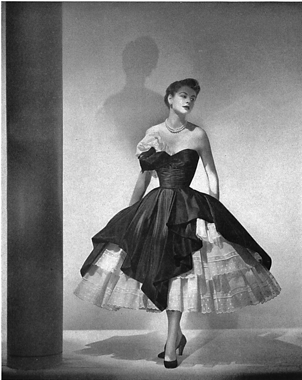
ADRIAN Black taffeta with white Swiss organdy-embroidered underskirt.