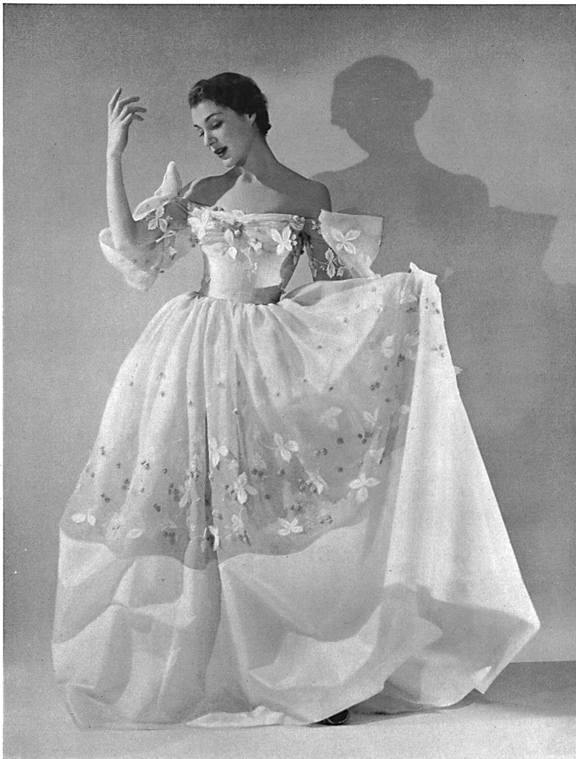
ADRIAN Blue Swiss organdy with white applied flowers and deep taf- feta hem.