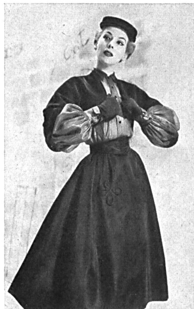
MATITA Shot blue and crimson Swiss organza blouse