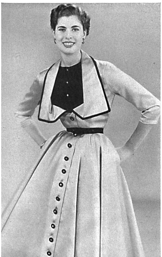
SUSAN SMALL Gold Duchess gaufre embossed satin from Haas & Co., Zurich

The big news in fabrics is velvet. An avalanche of velvet everywhere: for evening wraps, afternoon suits, daytime coats; for hats, blouses, cocktail dresses, ball dresses; for trimmings — collars, cuffs, pocket facings, linings. There is lots of black velvet; much coloured velvet, too. Embossed velvet, velvet appliqué with white grosgrain spots; street velvet, uncut velvet; and, at Sherard, a new straw velvet in a lovely spindleberry pink. Another sensation in fabrics for day is Donegal tweed, used more than ever before for greatcoats and suits, sometimes trimmed with velvet or fur. For evening and cocktail dresses there is a good deal of lace, tissue-paper taffeta, jersey. There is rich brocade, silk-satin, lamé, and satin-striped organza. Some suits are worn with blouses of velvet, lamé, organdie or fine lace.