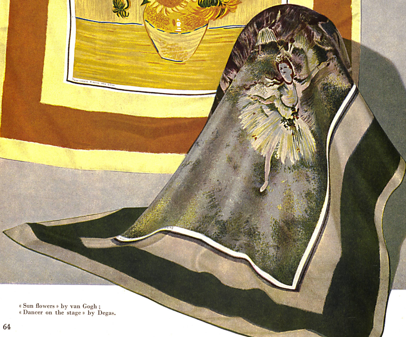
« Sun flowers » by van Gogh ; « Dancer on the stage » by Degas.