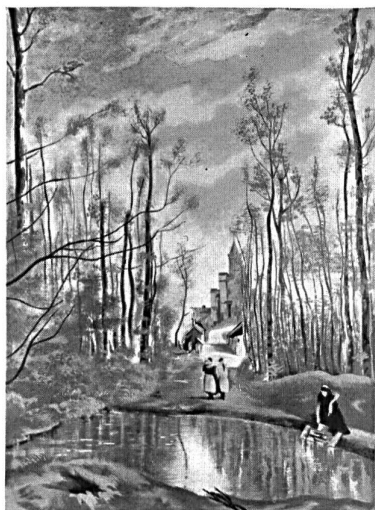
« Memories of Marissel » by Corot