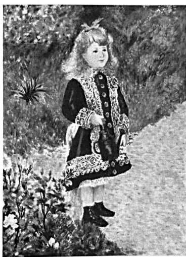
« Small girl with a watering can » by Renoir