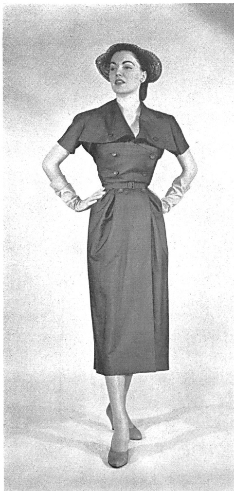
CHRISTIAN DIOR, NEW YORK Plain Super Miyako.