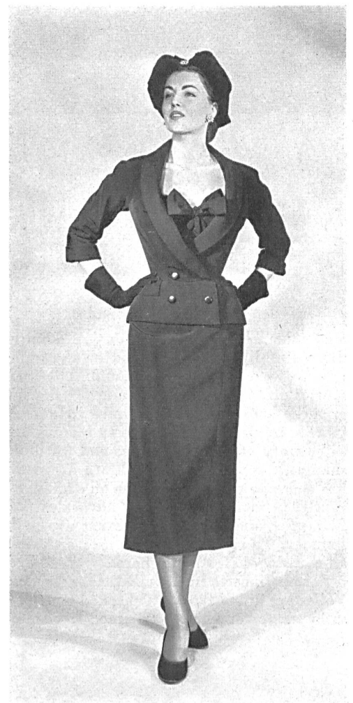
ELIZABETH ARDEN, NEW YORK Printed Atout.