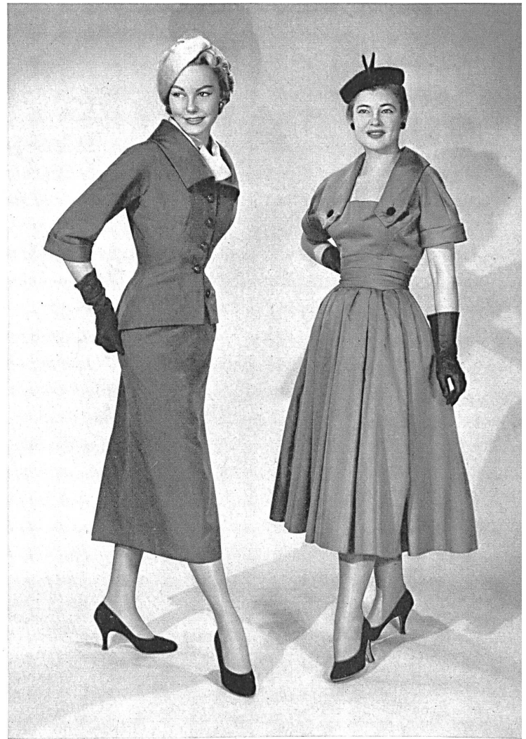
CHRISTIAN DIOR, NEW YORK

American mills and weavers in Switzerland and other European countries are all outdoing one another in ingenuity, and the market is flooded with an extra-