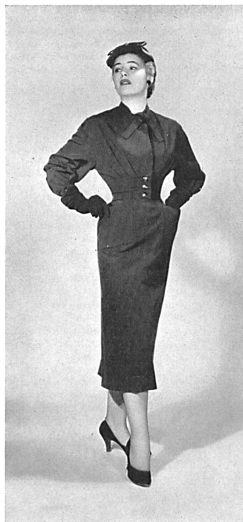
CHRISTIAN DIOR, NEW YORK