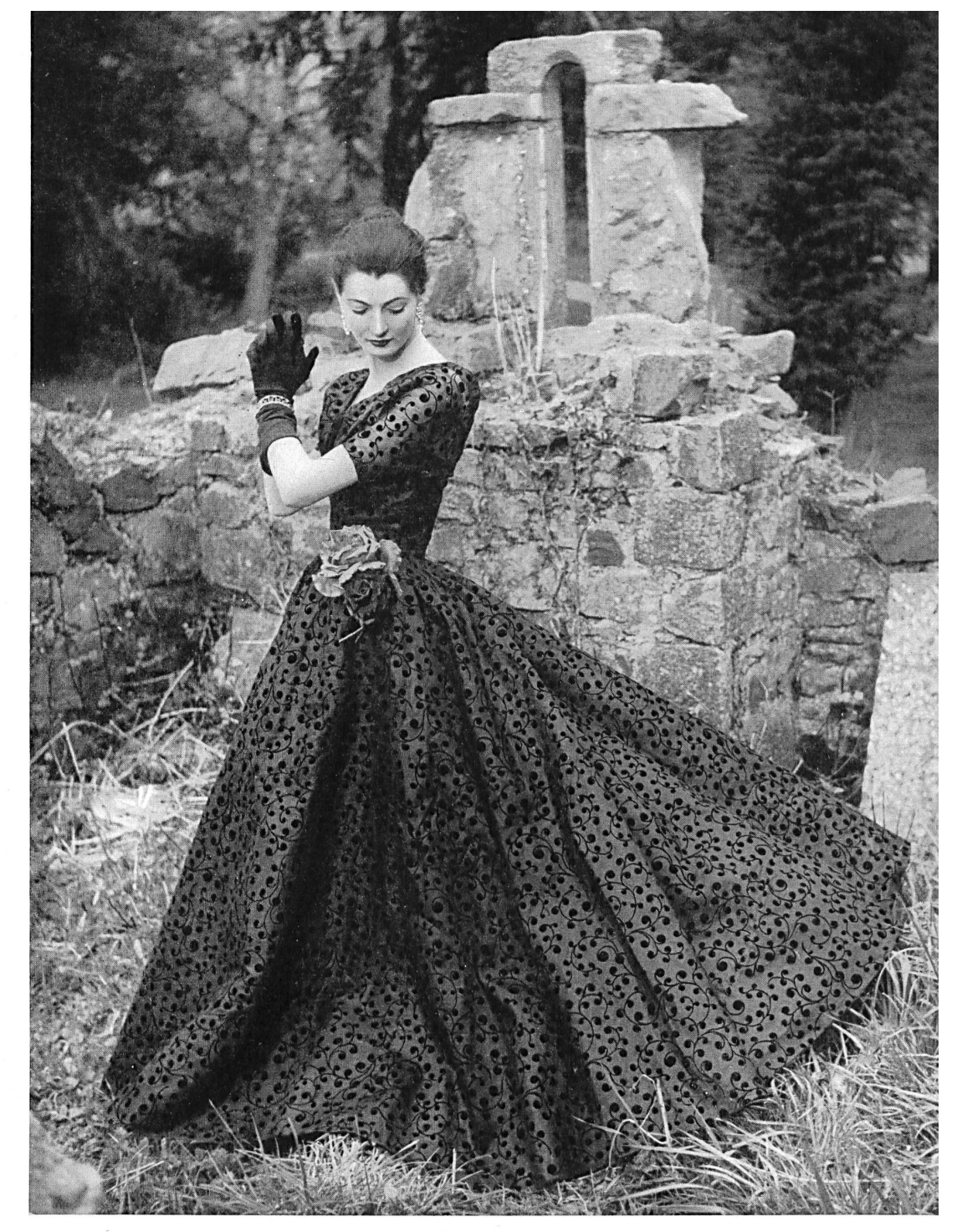
Irène Gilbert Ltd., Dublin Full black « Recoflock » evening dress. Fabric by Reichenbach & Co., SaintGall

and exciting range of fashion possibilities besides stockings that will not run at important moments and an end to unsightly darns on husbands' socks!