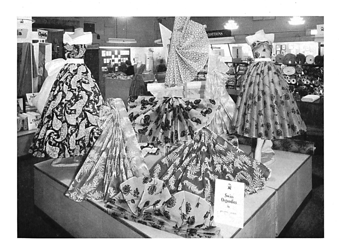
Reichenbach & Co., Saint-Gall

Only a few weeks ago a Press Reception was held in one of London's most famous houses - a centre, in grandmother's days, of royalty and high society - and there in the ballroom under the distinguished noses (in oils) of milords and ladies, a bevy of mannequins demonstrated garments made from Helanca yarn. They spent part of their time stretching, pulling and apparently trying to tear these garments to shreds; they even invited blasé journalists to tug at them. There were swimsuits by Balnea, underwear by Yala and foundation belts by Carina, stockings and ski-trousers, and the first English garments made from Helanca yarn produced in this country (under license by Messrs. John Heathcoat & Co. Ltd.). When I saw some of these same garments only a few days ago they hardly looked any the worse for maltreatment and wear - in fact, I think I could have sold them as brand new! Helanca certainly opens up a new