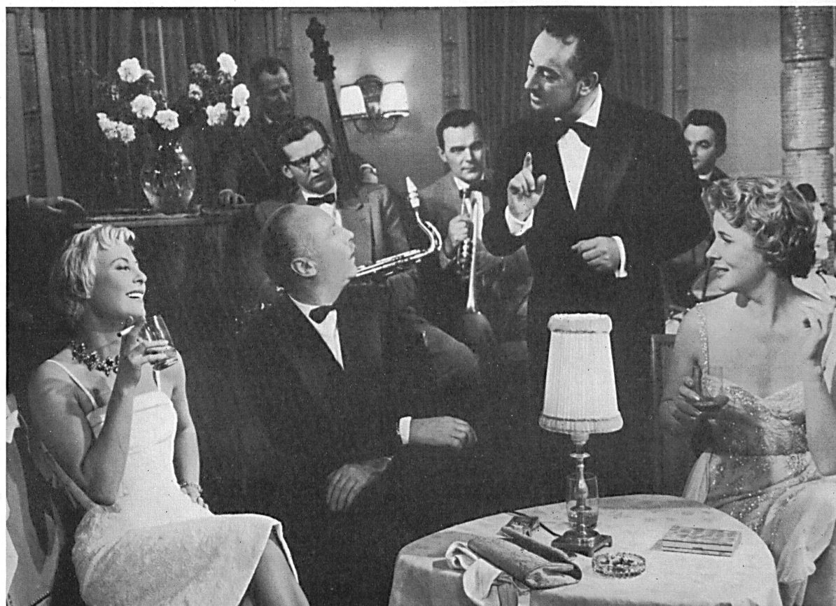
Michèle Morgan porte une robe de Hubert de Givenchy en toile brodée. Tissu de Rudolf Brauchbar & Cie, Zurich ; distribué par Montex, Paris. Scène tirée du film « Oasis » en cinémascope, de Yves Allégret, avec Michèle Morgan (à gauche) et Pierre Brasseur (au centre).

"I must say that for someone who takes no interest in these matters, you have a remarkable memory. But I have to agree with you to a certain extent. However, in order to be fair to both sides, I feel bound to say that it is the couturiers who start these terms when describing their collections on the printed sheets they hand to the press; they want to capture the imagination of the journalists and above all to enable those poor unfortunate women who have seen five hundred dresses in one day to remember the most characteristic features and to give the eager public some suggestive titles. That is what is known as publicity. Where you are wrong is in trying to deny the newspapers and magazines the right to talk about fashions. I am sure that you are one of the first to appreciate the descriptions of women's clothes in the pages of Balzac, because they give a picture of a bygone era and because they are written by Balzac, and you are enchanted when Marcel Proust launches into page-long descriptions of the hats and gowns of the ladies of Guermantes."