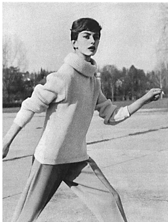
Beige after ski trousers and ivory coloured sweater.