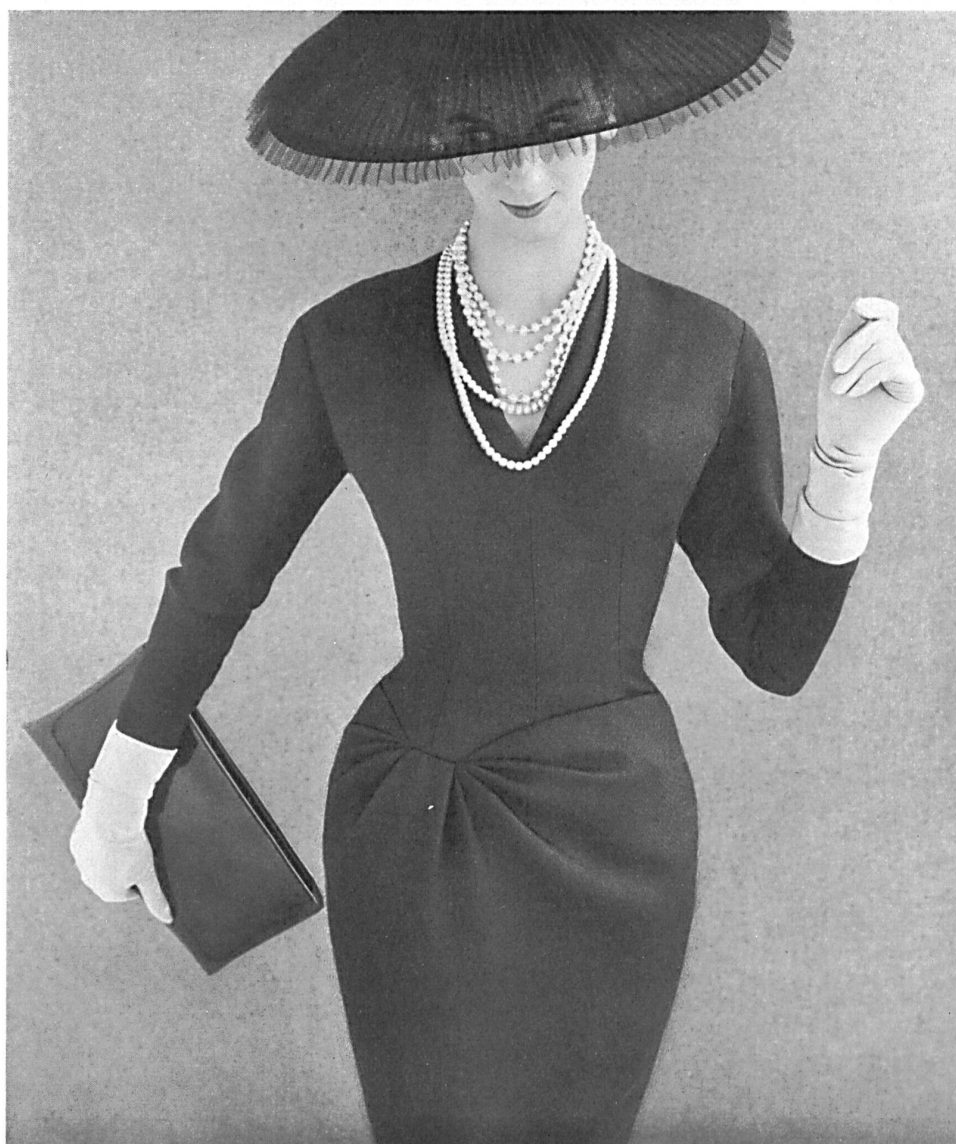
Roter Models Ltd., London

As our social (and private) amenities develop, so our wardrobes usually grow to suit the new circumstances; television has now brought new styles to televise in greater comfort. Though not strictly necessary it should be remembered that the new television fashions are well worth their expense since they will save on wear