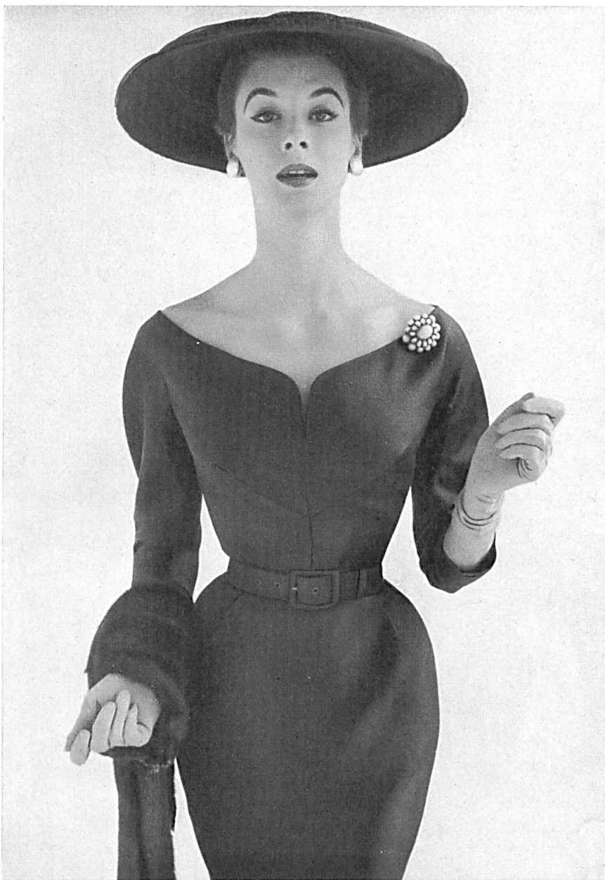
Roter Models Ltd., London

I have in fact just seen a very attractive Brocade by H. Gut & Co. (Zurich), now being used by Rodney Dresses — a Firm well-known for its careful styling and faultless finishing in the more moderately priced garments. In the more expensive ranges several wholesale Couture Houses, such as Roter Models, Roecliff & Chapman, Acquer, Marcus, Susan Small etc. are now regularly using Swiss fabrics.