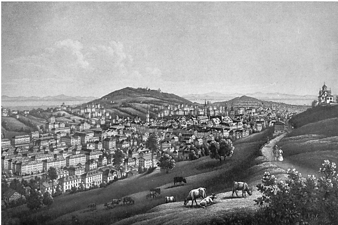
St. Gall in the 19th century, from a contemporary engraving.

From the 12th century onwards, as the influence of the monastery declined, so the importance of the town increased; as a result of continual quarrels with the Prince Abbot, the burghers of the town—who had banded together in corporations about the middle of the 14th century—obtained their independence, after having joined the Swiss Confederation in 1454. With the Reformation, the separation became complete, the town, following the example of its burgomaster, the humanist Vadianus (Joachim von Watt), having gone over to the new faith. The French Revolution marked the end of the Benedictine Abbey. Apart from the memory of its greatness, all that remains today are the buildings, part of which house the cantonal administrative offices while the rest is the diocesan centre, an admirable cathedral in the baroque style, built in the middle of the 18th century, with one of the finest naves in Switzerland, and decorated with a wealth