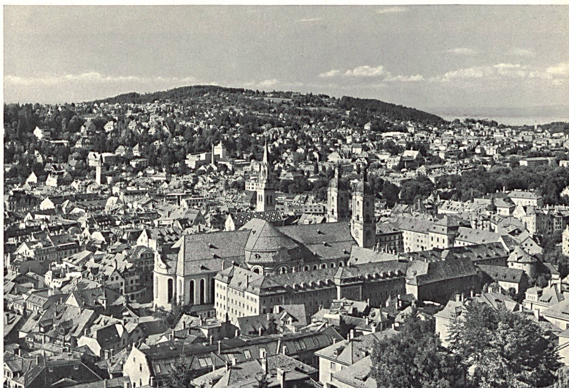
The St. Gall of today, a town of more 70 000 inhabitants; in the back-ground, the Lake of Constance.