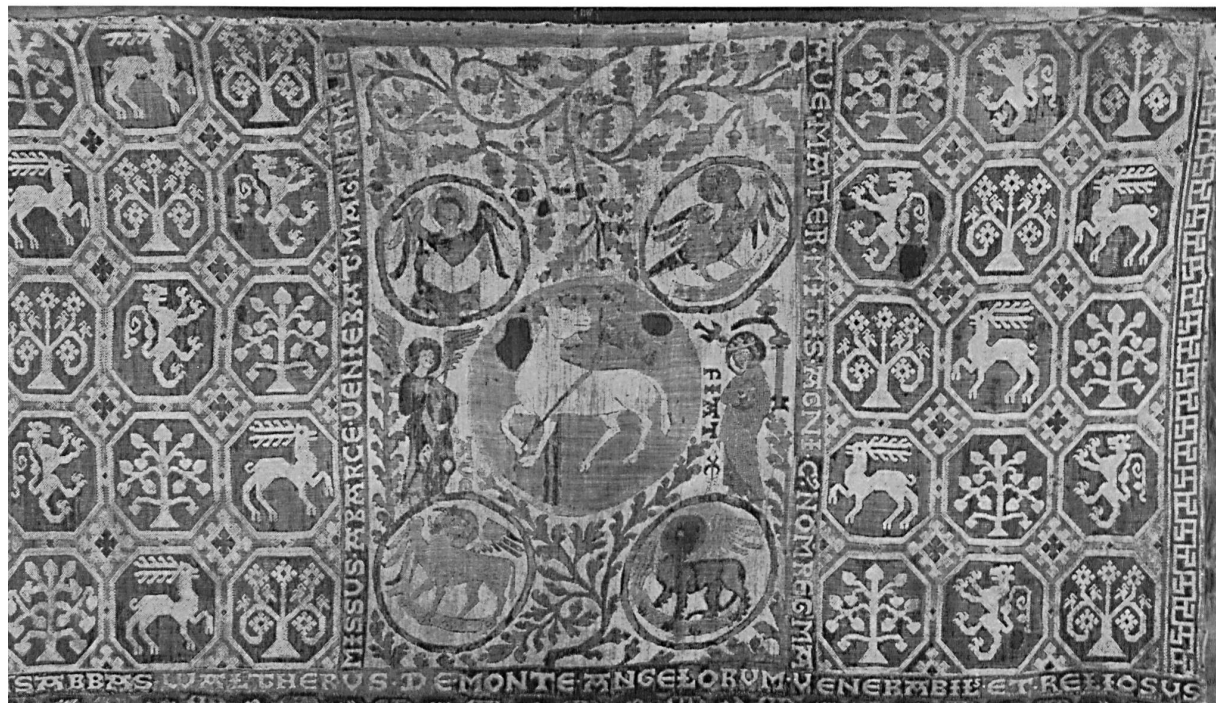
Iklé collection : the Antependium of Sarnen (Switzerland) ca. 1330. Embroidery in linen and coloured silk on a linen ground. In the centre, the Lamb of God, surrounded by the An- nunciation and the symbols of the four Evange- lists.