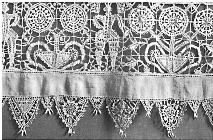
Iklé collection : openwork embroidery on linen ; Switzerland, 17th century.