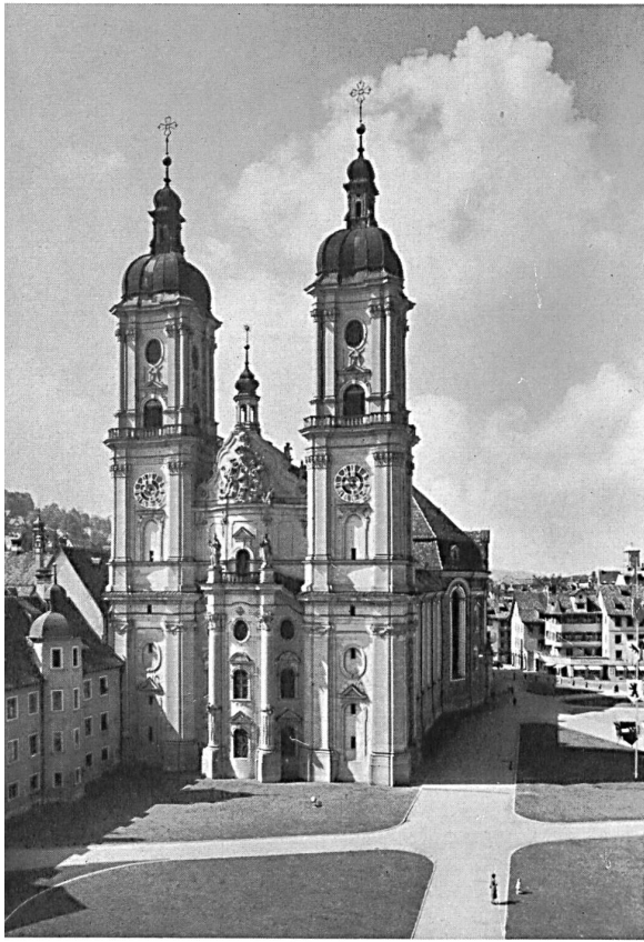
The St. Gall Minster, at present the cathedral of the diocese.

A town of burghers and merchants, centre of the embroidery and fine cottons industries