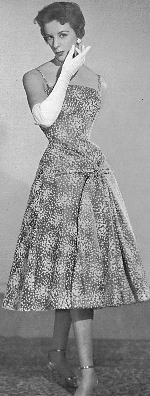
Frederick Starke Ltd., London Silk and rayon mixture by Rudolf Brauchbar & Co., Zurich

later than some twenty or thirty years ago, so that now summer sales and bargains precede the warmer weather ! Although it may be true that the finer qualities are frequently not included in these sales, the unfortunate result is that the sales take place and absorb the money which should be spent on normal stock at normal prices. Summer sales should not take place in early June before the warmer weather starts but just previous to the main holiday period, namely late July and August. Winter coats and suits are already