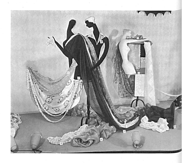
St. Gall embroideries and fine cotton fabrics.

The «Swiss Week» in Stockholm was a great success. Let us hope that it will have achieved its purpose by bringing about a lasting improvement in the trade relations between Sweden and Switzerland.