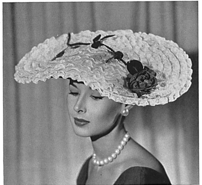
Swiss straw lace

You may remember Rex as the innovator of the be-pearled and be-jeweled sweater. When that fad reached tremendous proportions, Rex went on to the