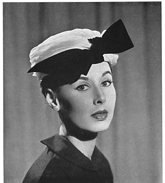
Swiss white organdy