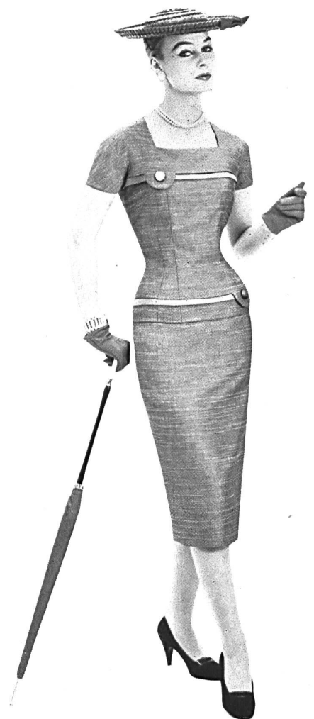
J. G. NEF & Co. Ltd., HERISAU

Skilfully finished cotton fabrics are soft and silken, stay fresh in use and have the essential quality of being washable. Mixtures of fibres are used to make fabrics