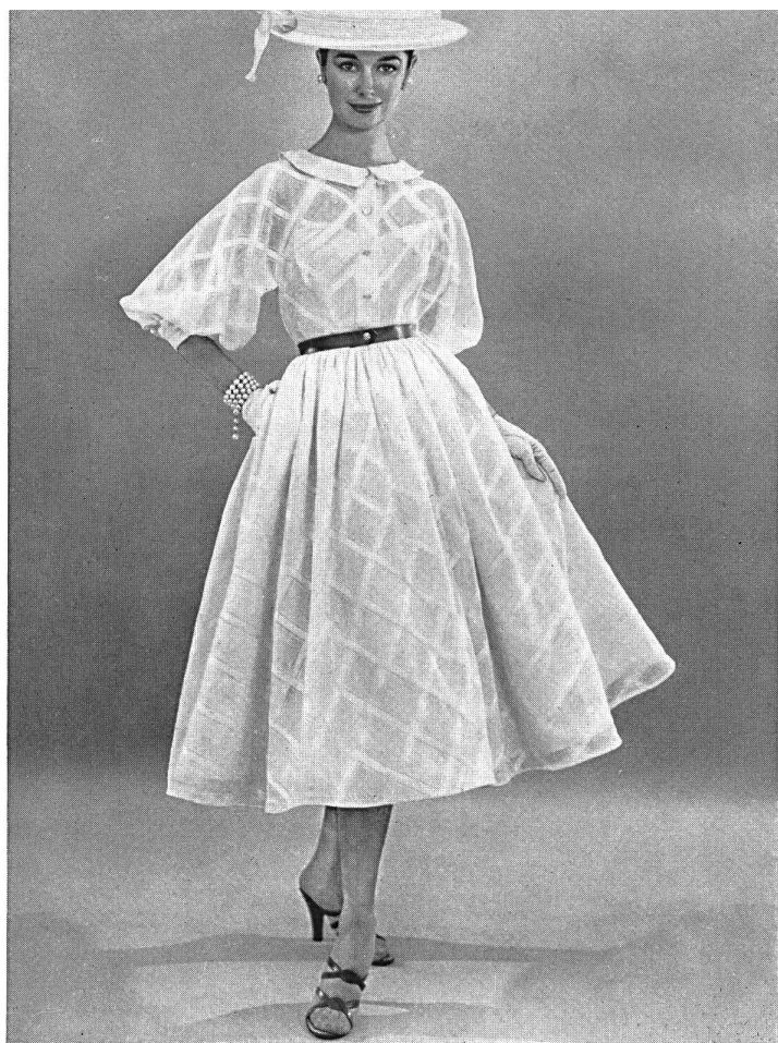
REICHENBACH & Co., SAINT-GALL

Colors no longer go by seasons. This summer there are a host of golden browns, greens and warm autumnal reds, as well as black and golden russets. These wintry colours are not at all out of place in July, and America, which takes a delight in colors, makes lavish use of them under a clear blue sky and in a light that is brighter than that of European climes. Cotton voiles, chiffons, coarse linens, fine linens and mixed fabrics are made in brighter, warmer colors which give a new and original look to these light fabrics which, henceforth, will be suitable for all seasons.