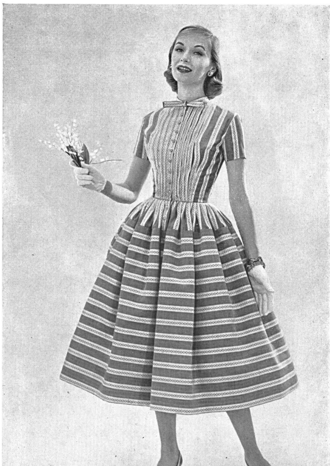
REICHENBACH & Co., SAINT-GALL