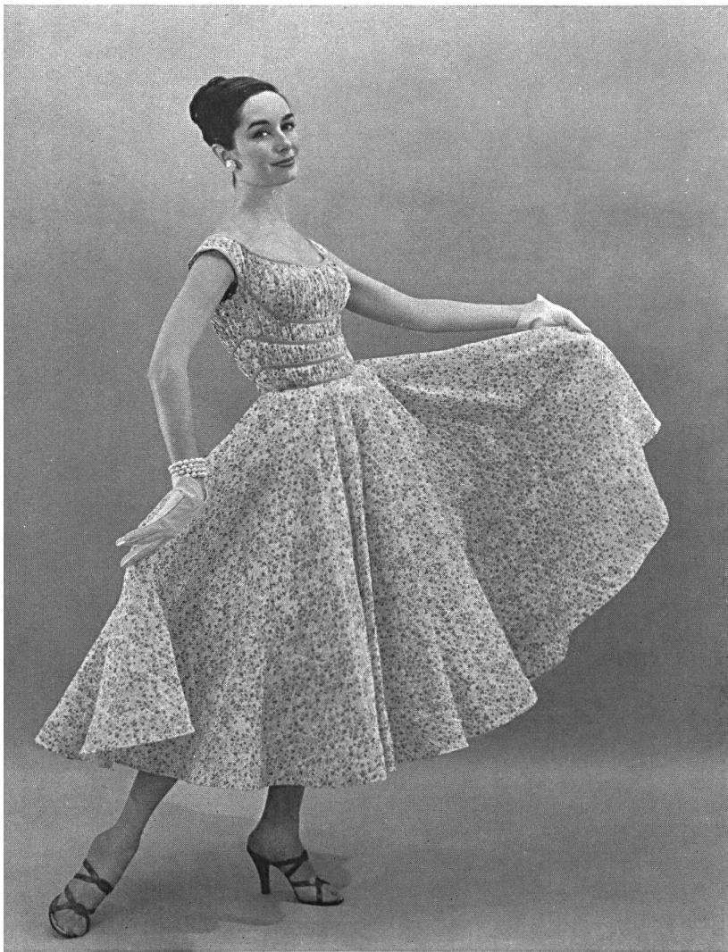
J. G. NEF & Co. Ltd., HERISAU

« Nelo flor » floral print on « Ondor »-Crepe. Model by Samuel Chapman Inc., New York.