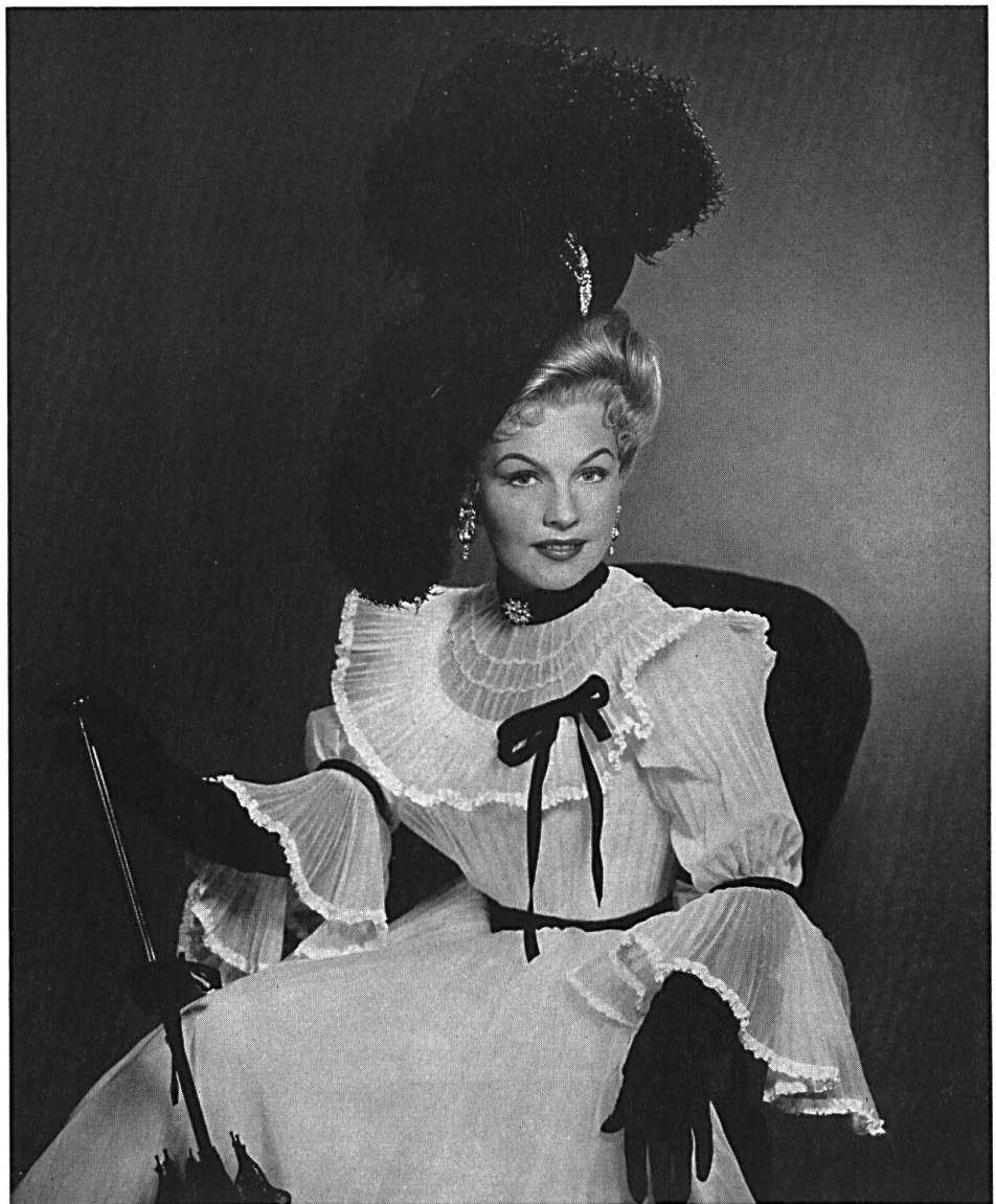
STOFFEL & Co., SAINT-GALL

Extraordinary care must also be exercised lest a gown be an anachronism, a deterrent to the action of a picture or a distraction to the viewers leading interest away from