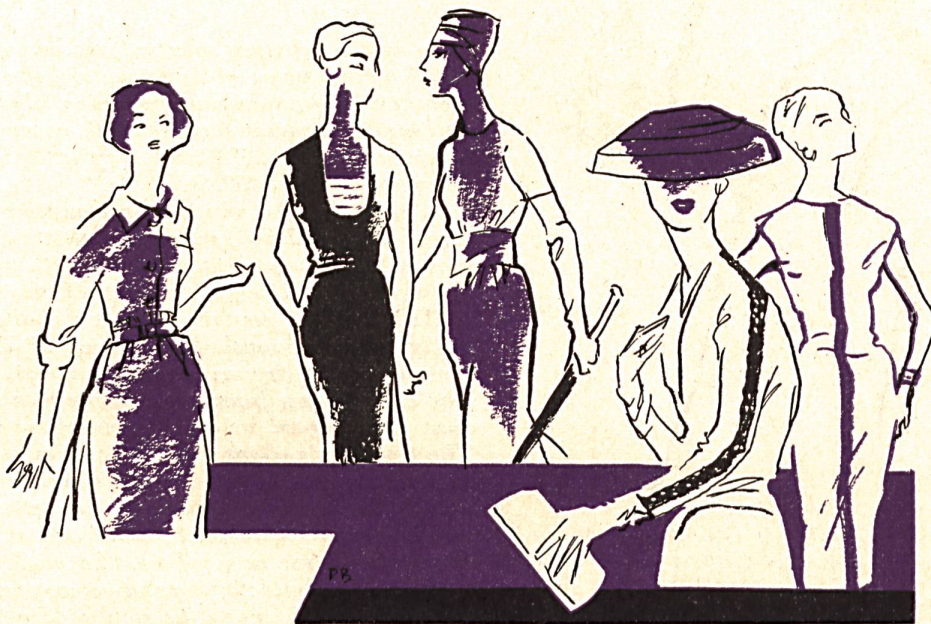
De gauche à droite : robe en lainage tabac, de Patou ; robe de drap noir, modestie de vison blanc, de Lanvin-Castillo ; robe de drap, effet de corselet, de Lanvin-Castillo ; ensemble de Balmain en velours noir, robe et veste à galon rebrodé.

1939 : a world collapsed, but Paris was determined to go on living in spite of the occupation. Dresses, hats and shoes were made of poor materials and the ingenuity of the couturiers was stretched to the limit. Then