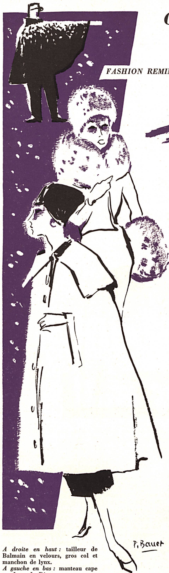
A droite en haut : tailleur de Balmain en velours, gros col et manchon de lynx. A gauche en bas : manteau cape en drap, de Dior.

FASHION REMINISCENCES, EVOKED BY THE NEW COLLECTIONS