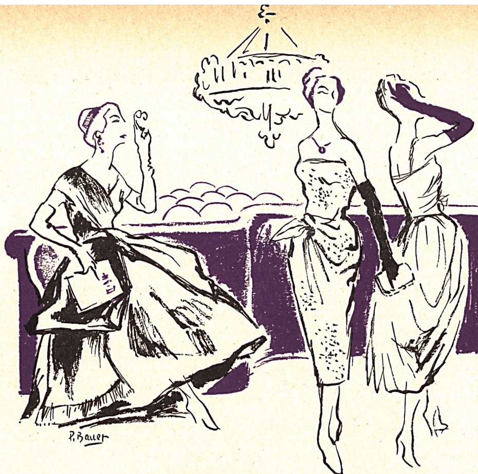
De gauche à droite: robe du soir drapée, de Dior, grand nœud en ottoman; robe du soir étroite, drapée, en satin rebrodé, de Catherine Sauve; Dior: mousseline drapée.

very few — watertight compartments between fashion houses. Less than ever today is it possible to recognise the designer of a woman's dress at a glance. I am not saying that this is a bad thing, simply that it is different.