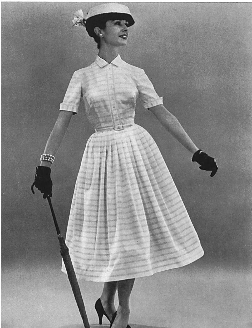
SWISS FABRIC GROUP, NEW YORK