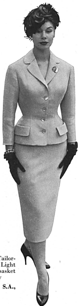
Switzerland : Tailor-made costume. Light beige pure wool basket weave worsted by Pfenninger & Co S.A., Wädenswil.