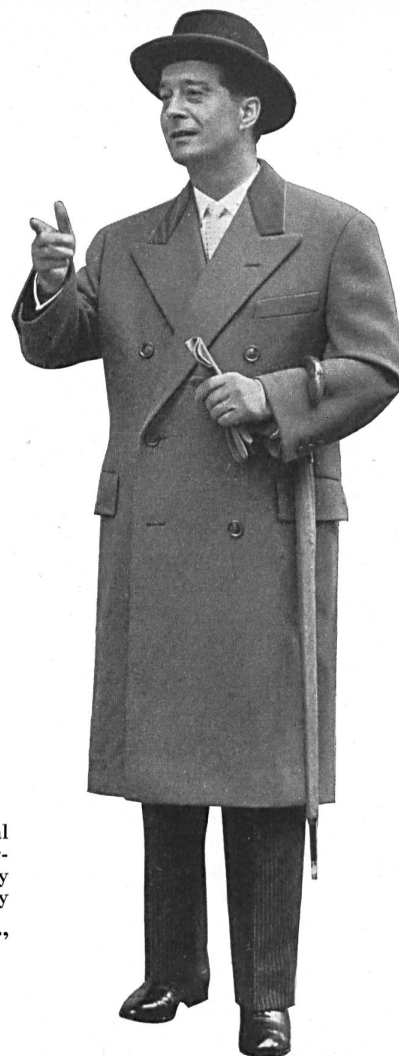
Switzerland : Classical double-breasted overcoat. Heavy blue grey pure wool Shetland by F. Hefti & Co. S.A., Hätzingen.