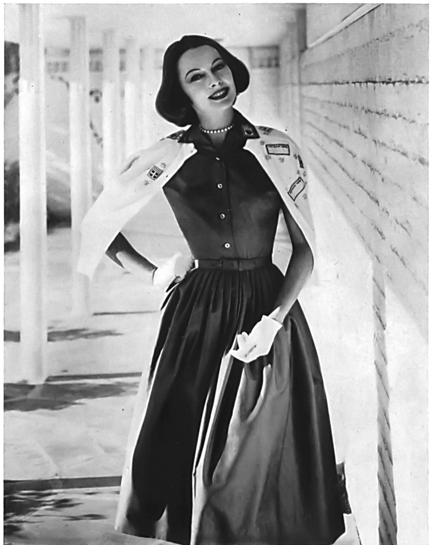
HAUSAMMANN TEXTILES LTD., WINTERTHUR Cotton broadcloth.