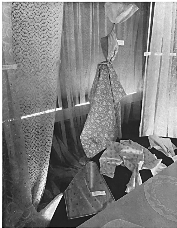
Part of the stand of the Swiss Cotton and Embroidery Industry at the First International Fashion Fair, London.

A gradually increasing number of the smaller manufacturers who have so far been frightened or perplexed by export trading are realising that this is a new problem which must somehow be solved and which may in fact not