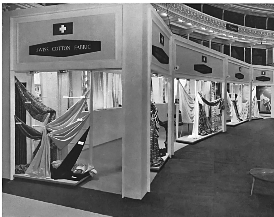
Stand of the Swiss Cotton and Embroidery Industry at the First International Trade Fashion Fair, London (November 18-22, 1957).