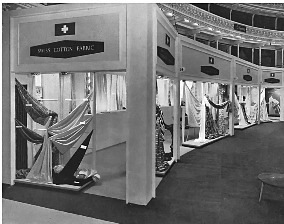
Stand of the Swiss Cotton and Embroidery Industry at the First International Trade Fashion Fair, London (November 18-22, 1957).