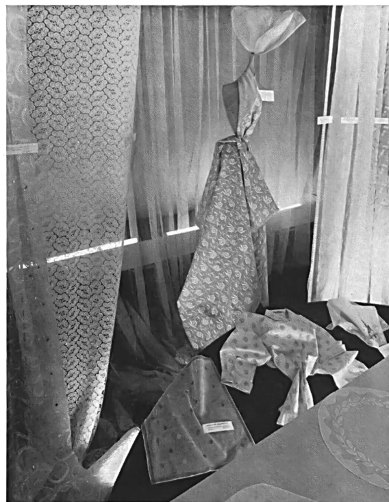
Part of the stand of the Swiss Cotton and Embroidery Industry at the First International Fashion Fair, London.

A gradually increasing number of the smaller manufacturers who have so far been frightened or perplexed by export trading are realising that this is a new problem which must somehow be solved and which may in fact not