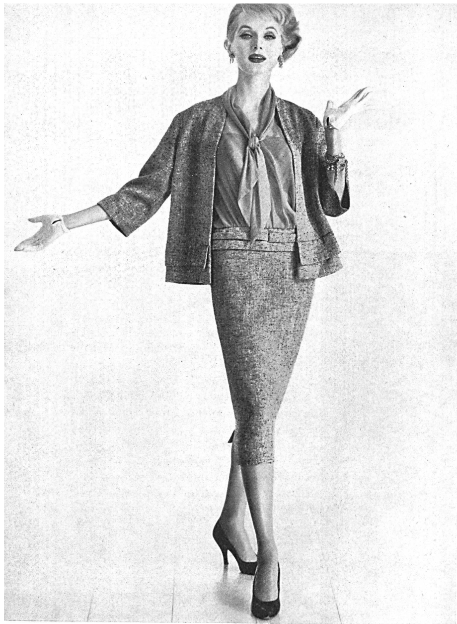
HEER & Co. Ltd., THALWIL Brown and white silk tweed. Model Don Loper, Los Angeles.

with sleek, finely knit Swiss wools for day wear, furs used like fabrics over Swiss silks and re-embroidered laces, or cut velvets re-worked in shapes to glamorise the entrance of any great lady for a very special evening.