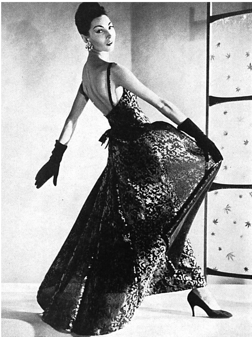
L. ABRAHAM & CO. SILKS LTD., ZURICH

Basra broché or. Gold brocaded Basra. Model by Pauline Trigère.