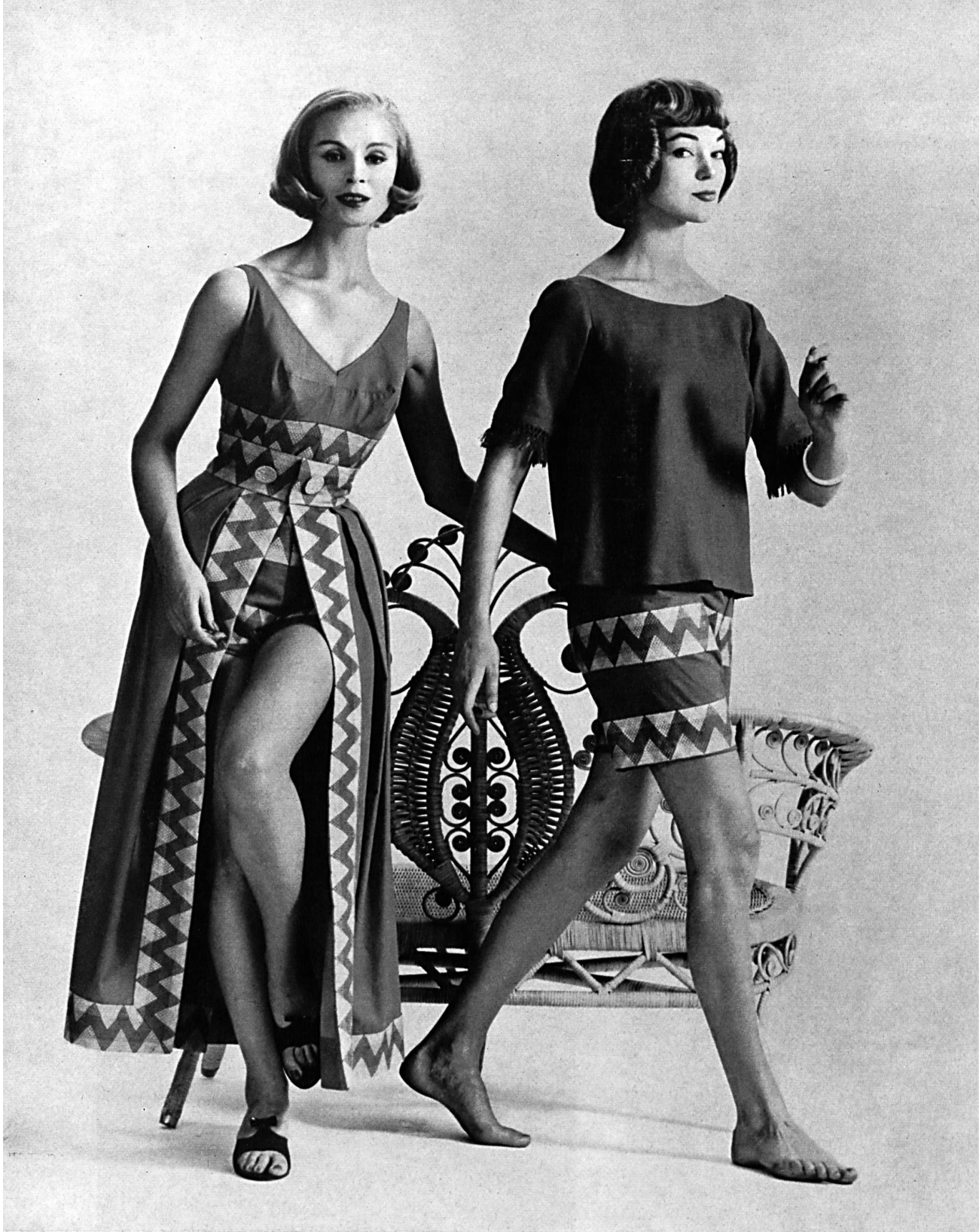
Ensembles de plage et de bain avec dessins aztèques. Beach outfits with Aztec designs. Models by Tina Leser.

by the representatives of St. Gall firms in New York. They are admirably suited not only for wear in the tropics but also for town outfits in the summer, for traveling and the varying climates of the different states.