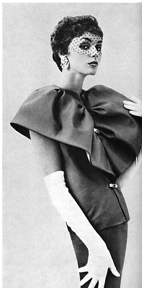
L. ABRAHAM & CO. SILKS LTD., ZURICH

Basra broché or. Gold brocaded Basra. Model by Pauline Trigère.