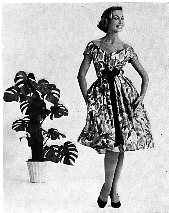
Model by Adele Simpson.