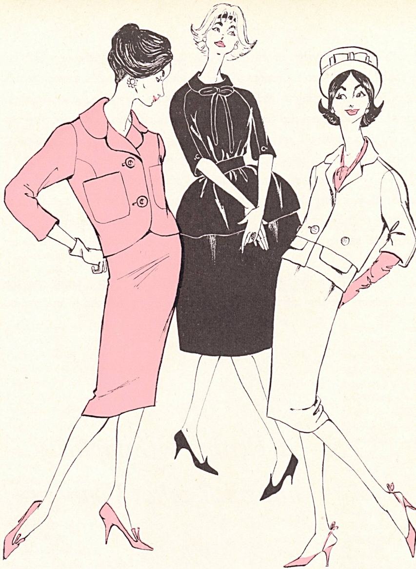
Left: JEAN DESSÈS Centre: NINA RICCI Right: MAGGY ROUFF

It seems as though, after last season's experiments — which were admittedly amusing but often looked like disguises for a fancy dress party — after the sack dresses, the imitation Empire gowns and the short skirts, designers suddenly remembered that women demanded something more than marvels of skilful cutting, no matter how clever, that with the return of spring they wanted, like the apple tree with its young pink blossom, like the lilac with its heady flowers, to be rejuvenated, clad in freshness, enveloped with soft hues.