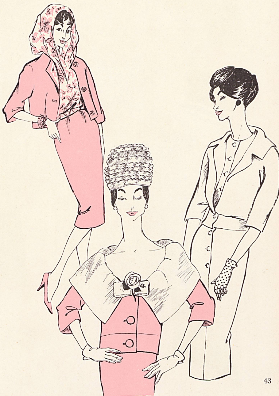
Left: GUY LAROCHE Centre: PIERRE CARDIN Right: JACQUES HEIM

All at once I feel rather inadequate for I suddenly realise that I have told you nothing of the technical side of the latest collections. Perhaps it is because, at this season, technique is hidden. It is there though, it is the framework, the backdrop on which the dazzling arabesques have been embroidered.