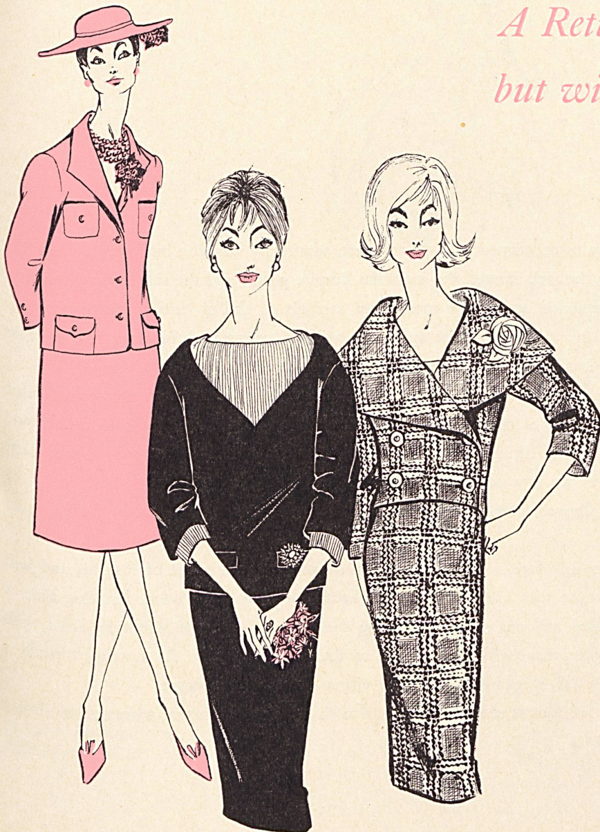
Left: CHANEL Centre: CHRISTIAN DIOR Right: PIERRE CARDIN

A Return to Simplicity... but with what Virtuosity!