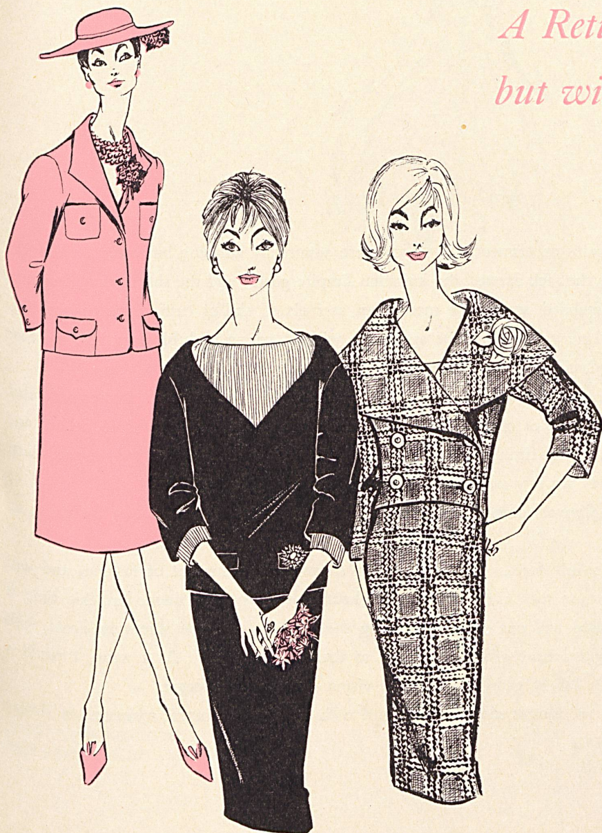
Left : CHANEL Centre : CHRISTIAN DIOR Right : PIERRE CARDIN

A Return to Simplicity... but with what Virtuosity!