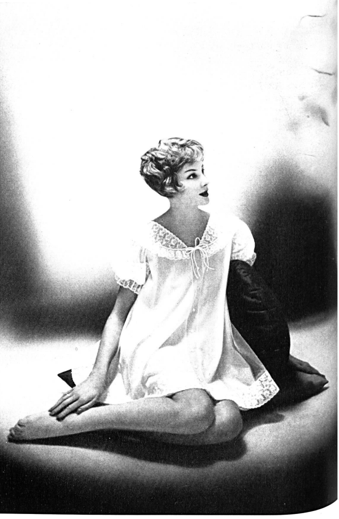
BISCHOFF TEXTILES LTD., SAINT-GALL

Embroideries on nylon. Broderies sur nylon. Model by Kickernick, Inc., Minneapolis.