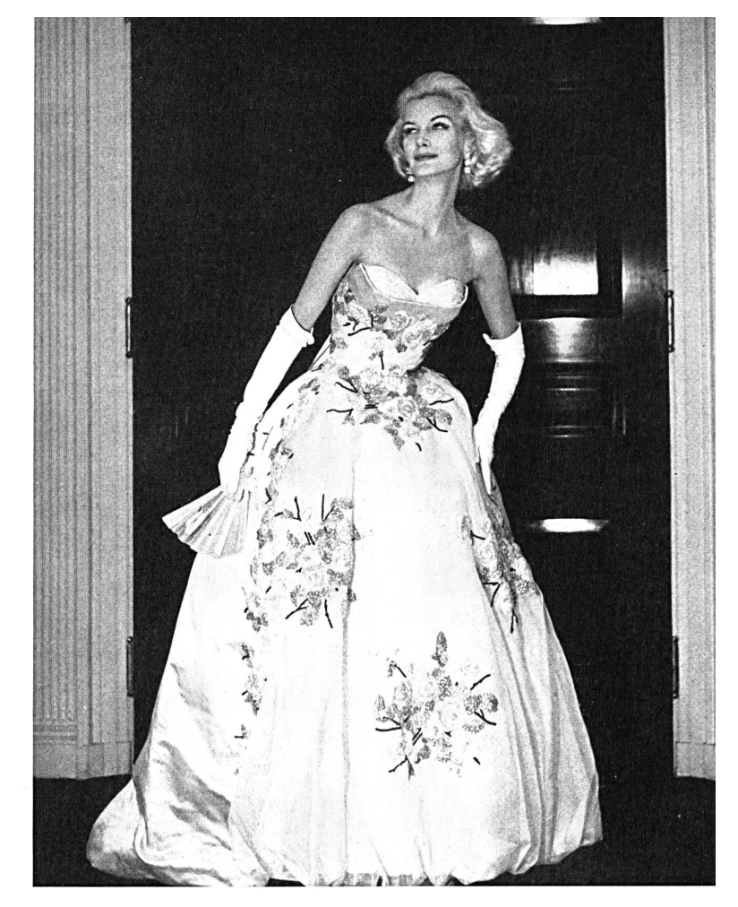
FOSTER WILLI & CO., SAINT-GALL

The fine cotton fabrics, embroideries, woollens, mixed fabrics and tricots imported from Switzerland owe a considerable part of the excellent reputation they enjoy in American ready-to-wear circles to the continual progress made with regard to finish and deying. All the ultra-modern qualities, such as Wash-and-Wear, Drip-and-Dry, No-Iron, are possessed by these Swiss articles, even the fragile embroideries and fine Victorian style cotton fabrics, which are still triumphantly up to date in this era of jet aircraft and atomic power. Cilander of Herisau has